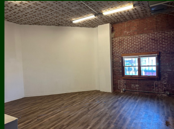
4084 Erie St., Willoughby, OH