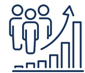
Annual Population Growth