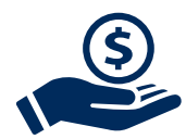
Avg. Household Income