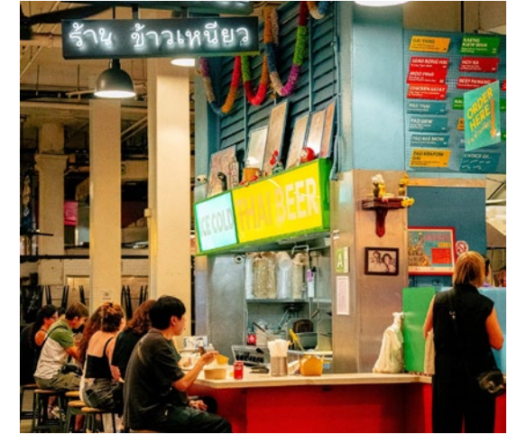
📍 STICKY RICE