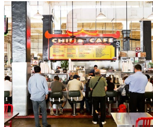
📍 CHINA CAFE