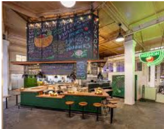
📍 MIZNON PITA CAFE