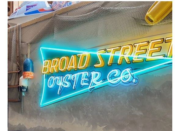
📍 BROAD STREET OYSTER CO.