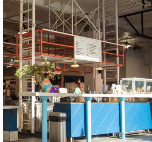
📍 GO GET EM TIGER