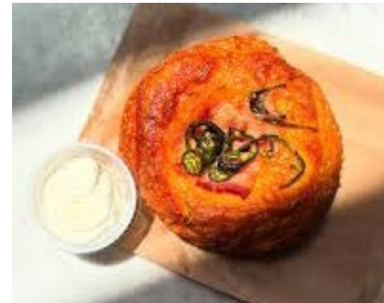
📍 BASTION BAKERY