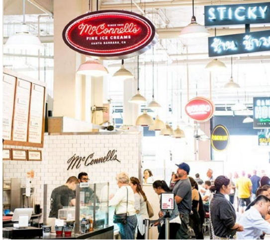
📍 MCCONNELLS ICE CREAM