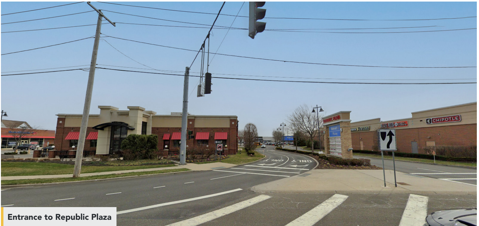
Entrance to Republic Plaza