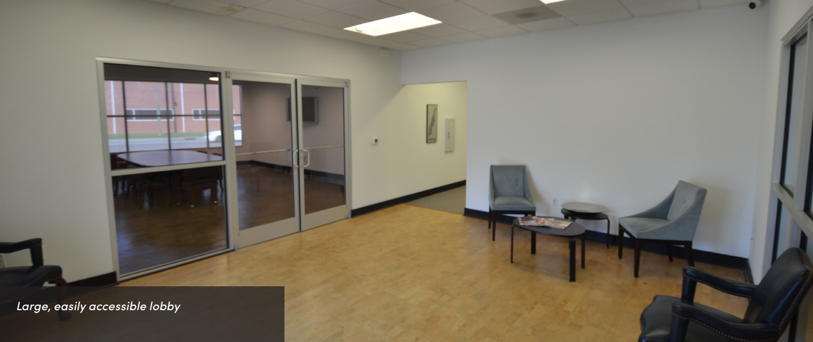
Large, easily accessible lobby