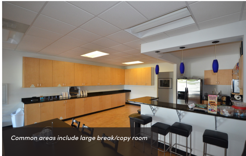
Common areas include large break/copy room