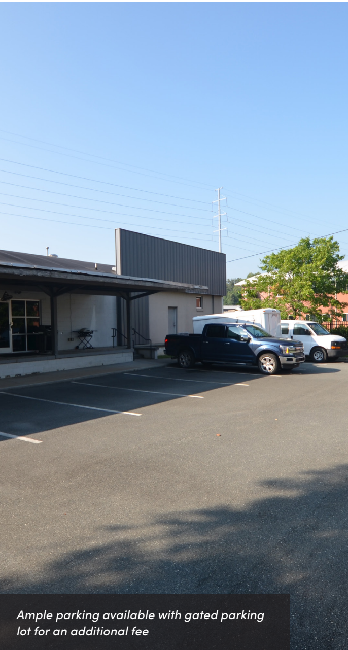
Ample parking available with gated parking lot for an additional fee