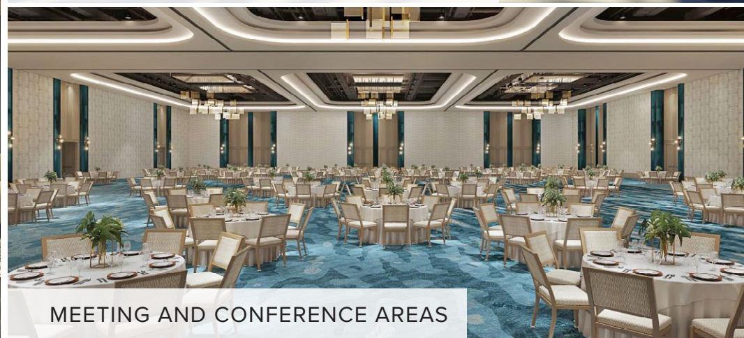
MEETING AND CONFERENCE AREAS