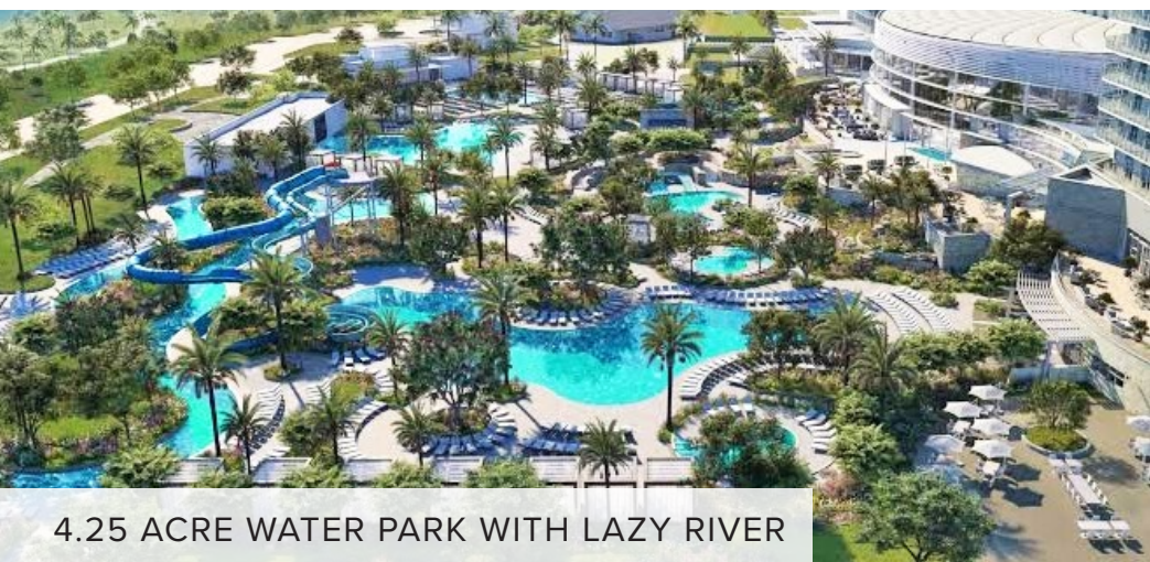
4.25 ACRE WATER PARK WITH LAZY RIVER