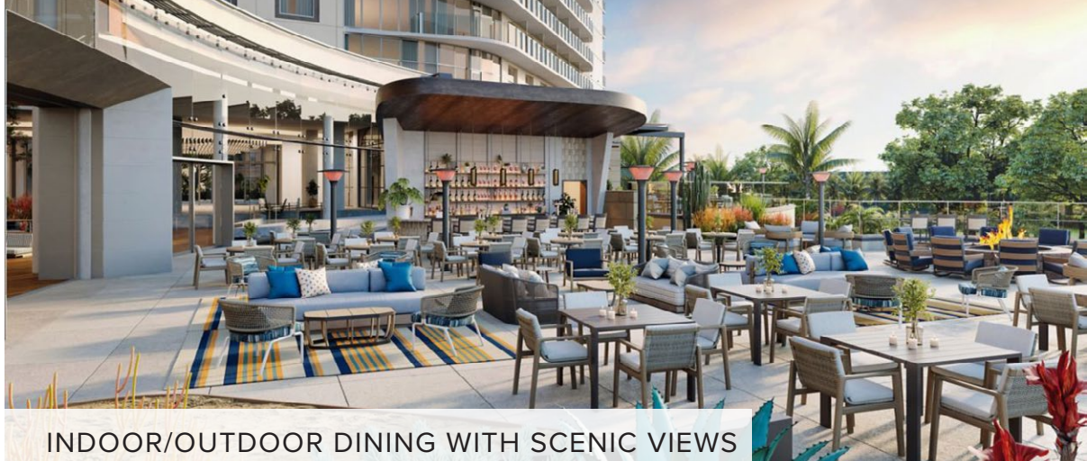
INDOOR/OUTDOOR DINING WITH SCENIC VIEWS