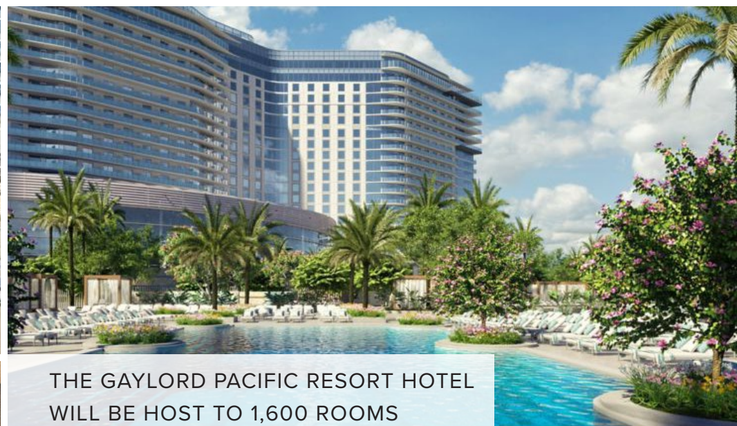
THE GAYLORD PACIFIC RESORT HOTEL WILL BE HOST TO 1,600 ROOMS