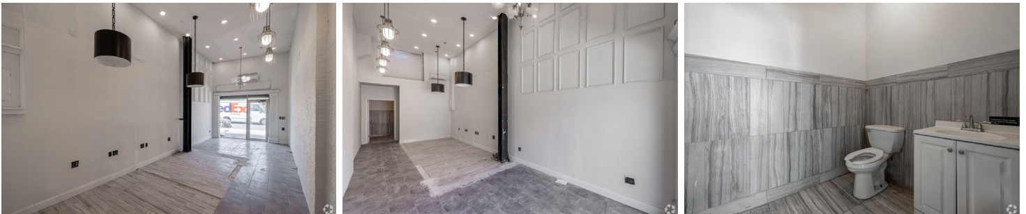
White-box interior, restroom and modern finishes