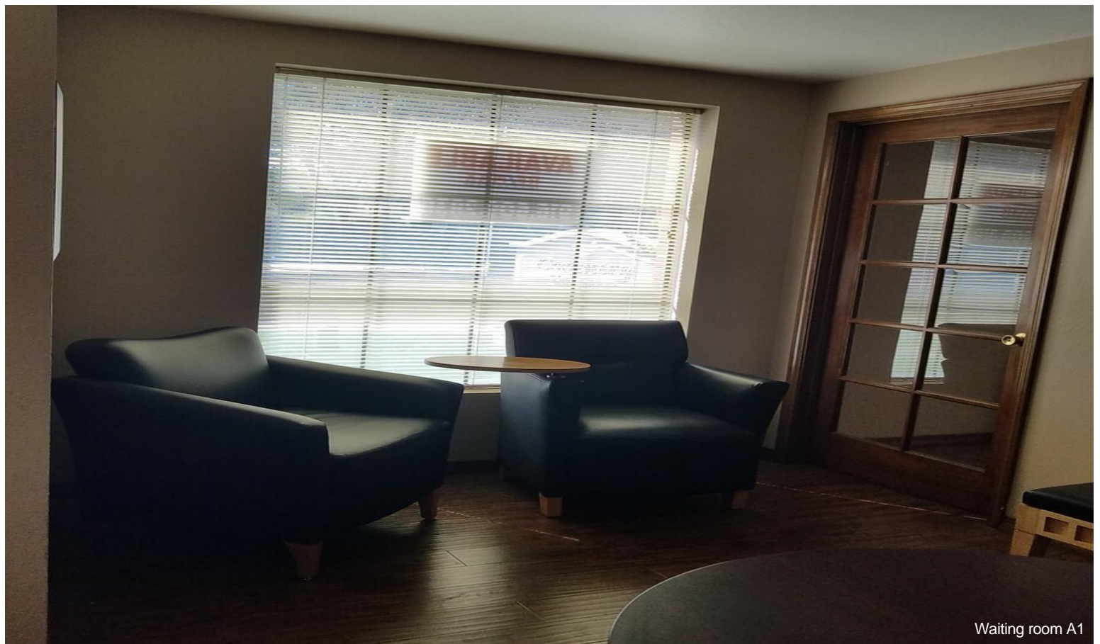
Waiting room A1