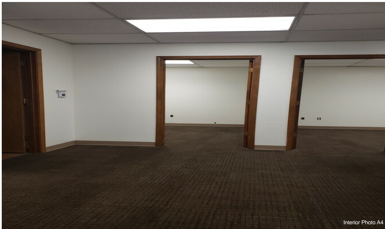
Interior Photo A4