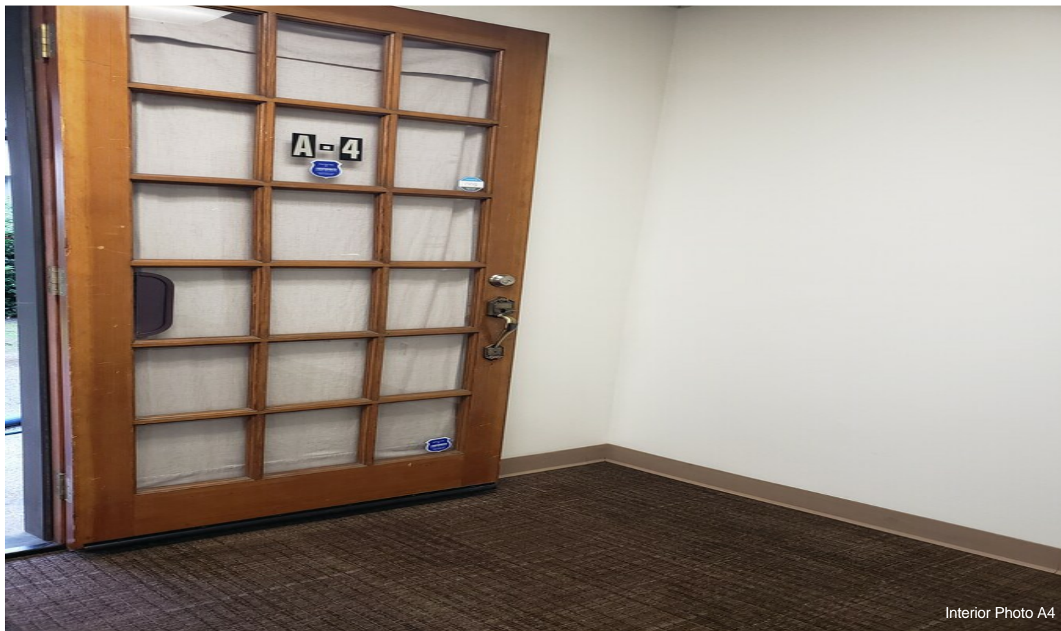
Interior Photo A4