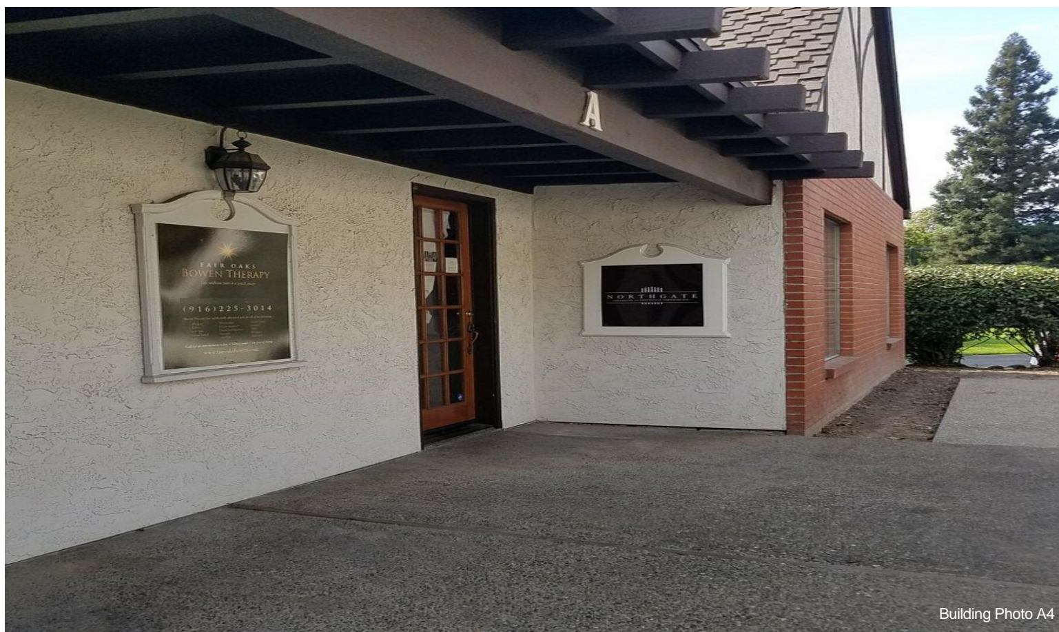
Building Photo A4