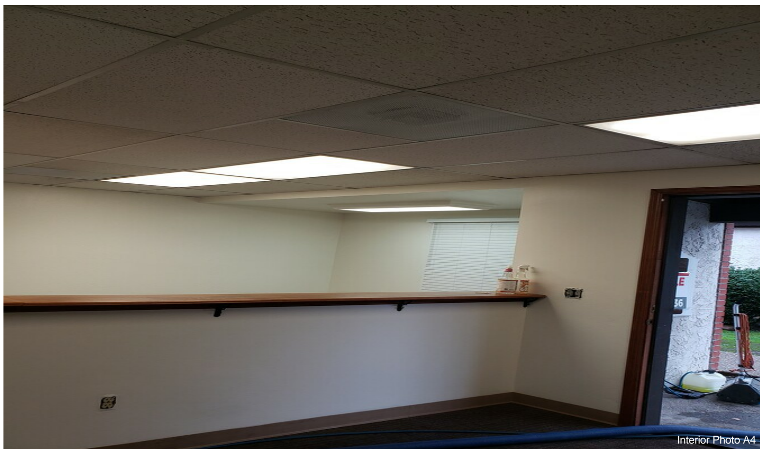
Interior Photo A4