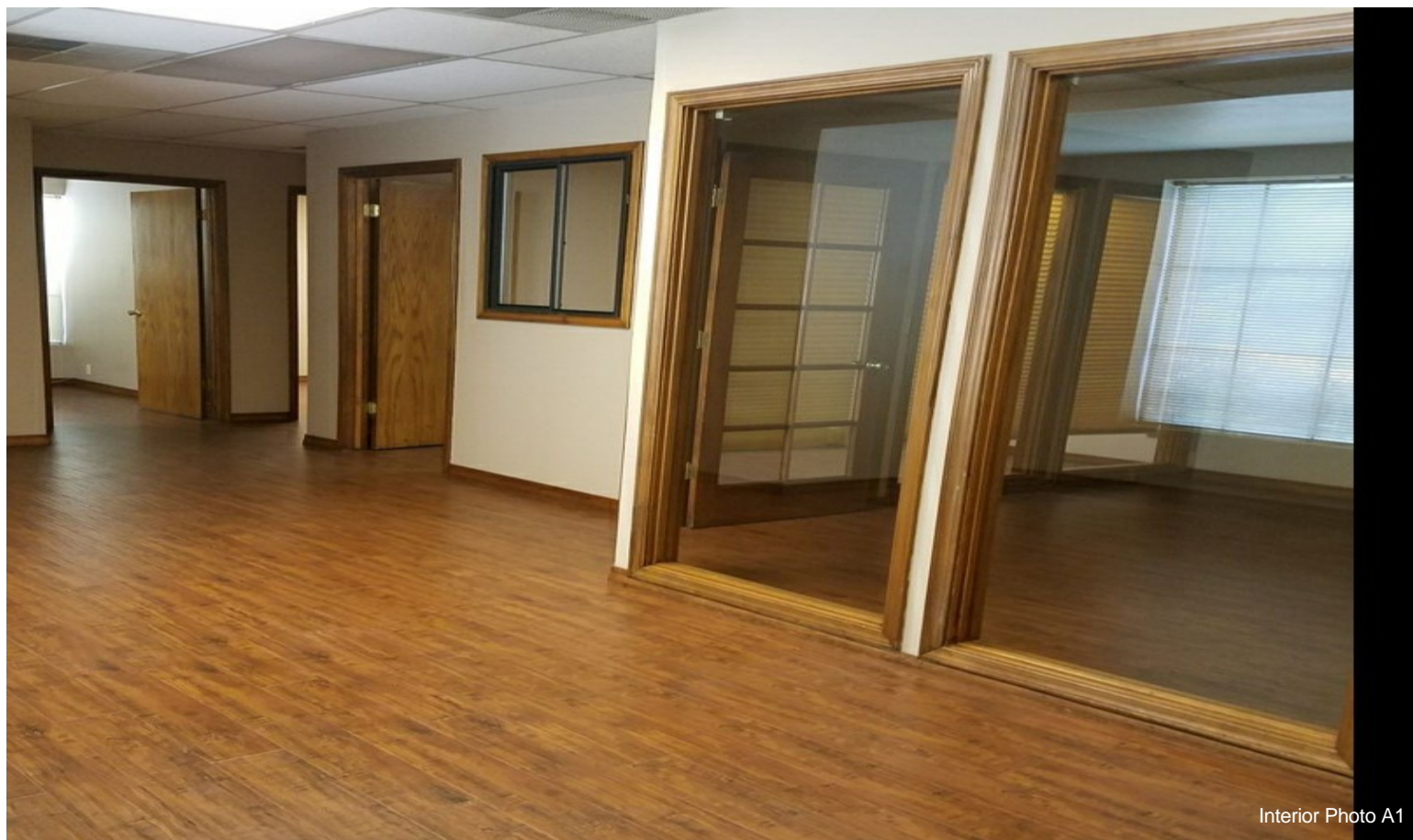
Interior Photo A1