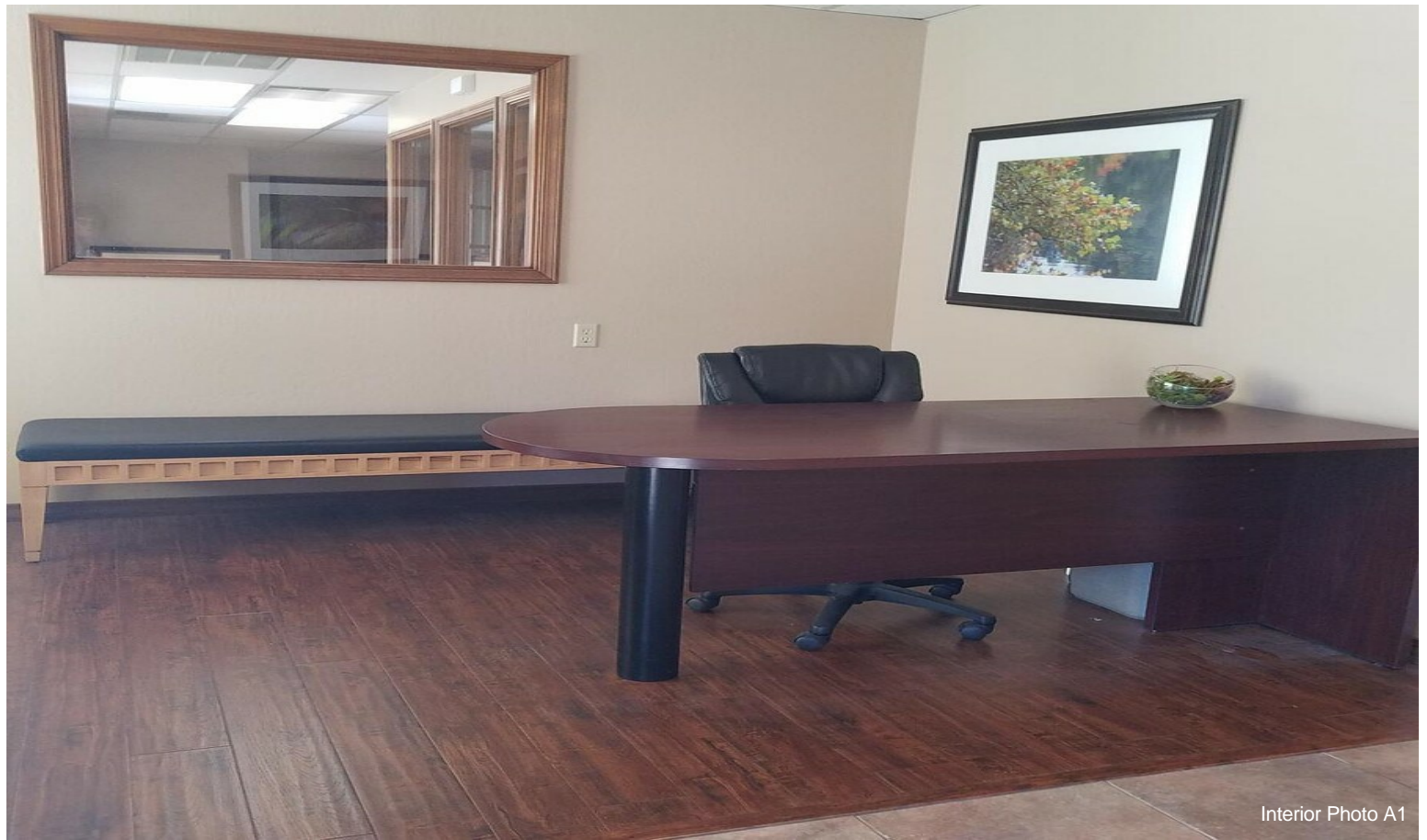
Interior Photo A1