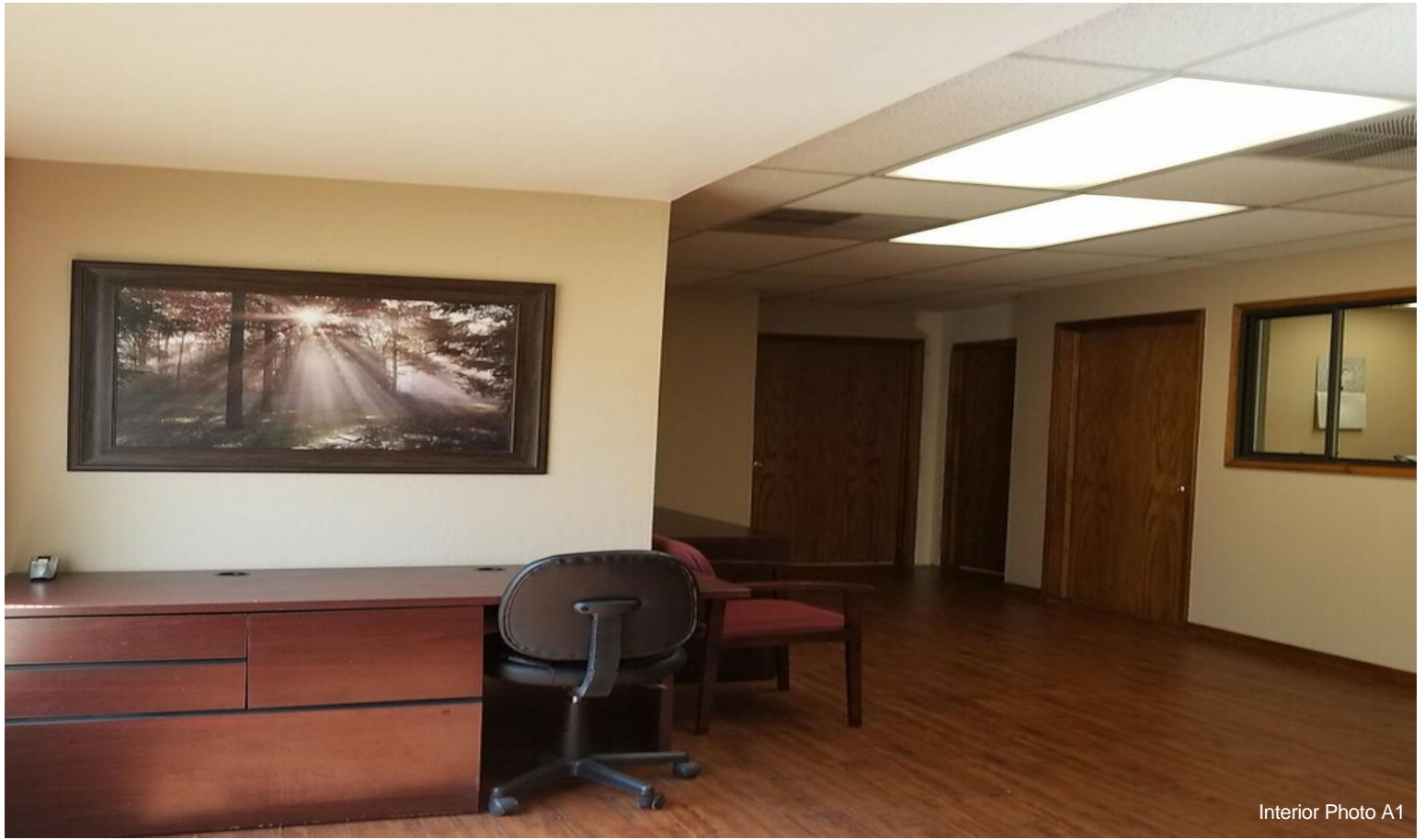
Interior Photo A1