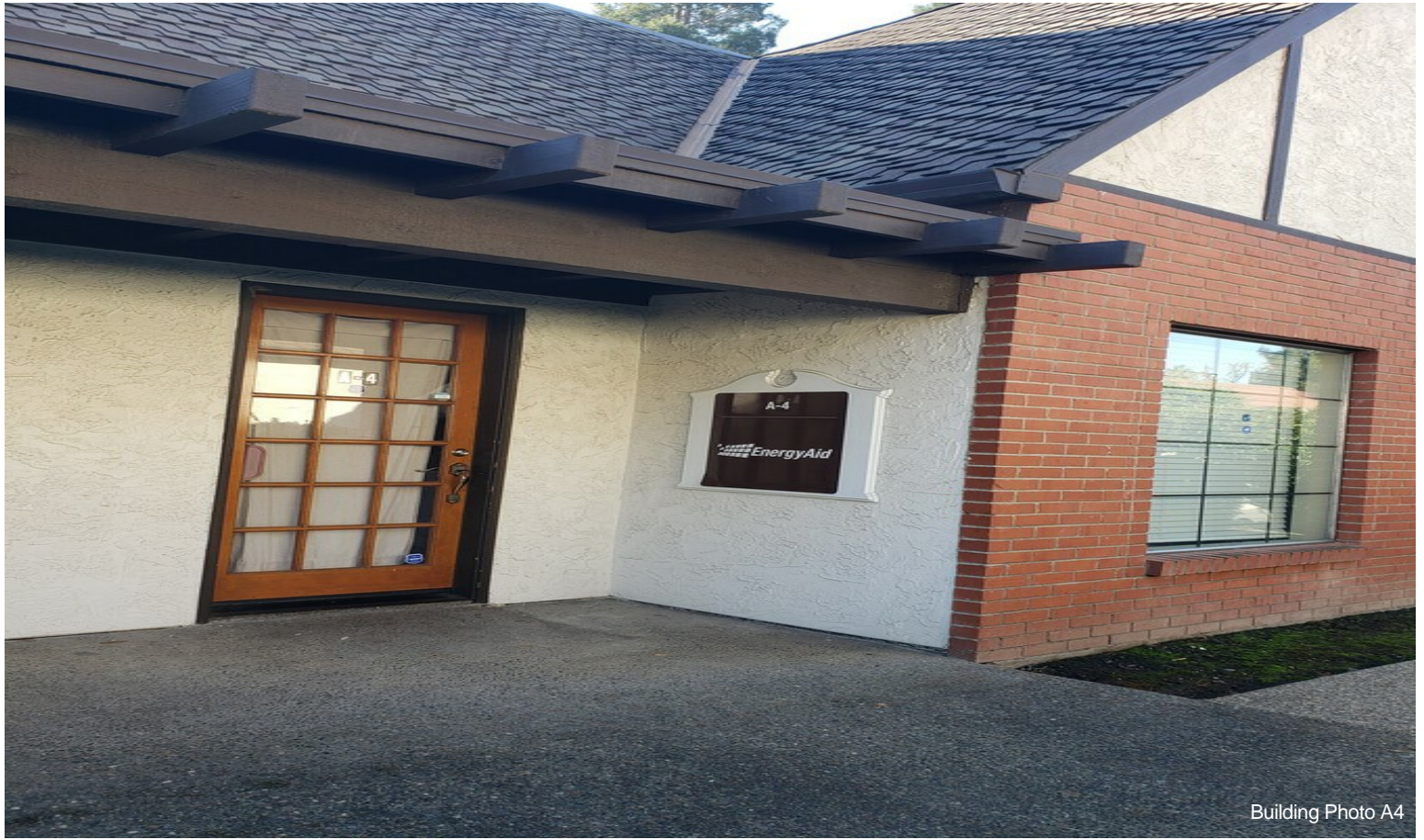
Building Photo A4