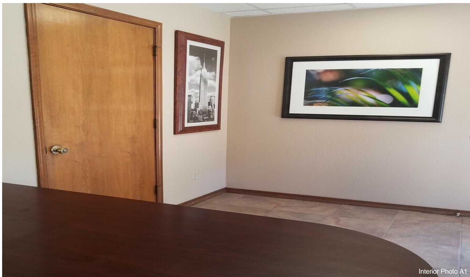
Interior Photo A1