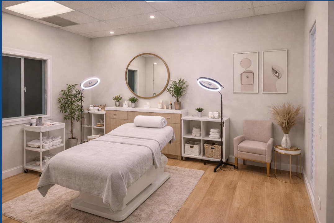
*AI Generated Mockup of Space