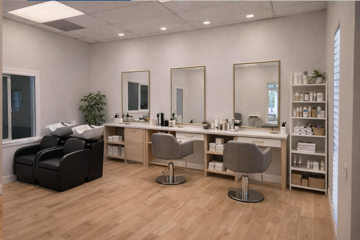
* AI Generated Mockup of Space