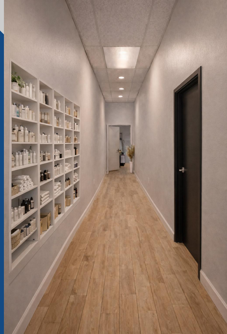
*AI Generated Mockup of Space