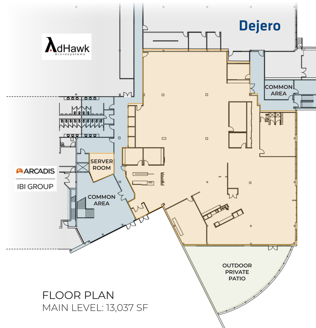
FLOOR PLAN MAIN LEVEL: 13,037 SF

Located in the Waterloo Technology Campus, this 13,037 SF fully built-out space is the perfect size and cost for a growing company. Features include a large kitchen and private outdoor patio area, fitness room and change area, meeting rooms, boardroom and open office environments. Large windows flood the space with natural light. There is also on-site property management, abundant parking and signage available.