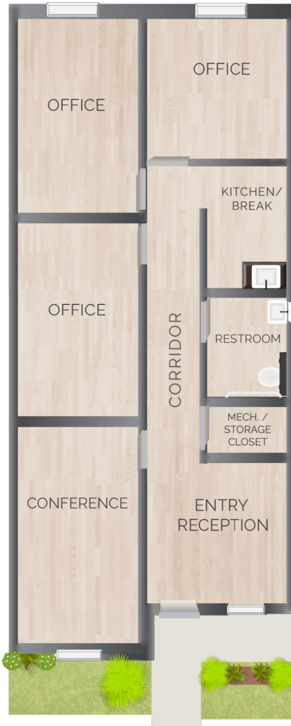
OFFICE SPACE PLAN