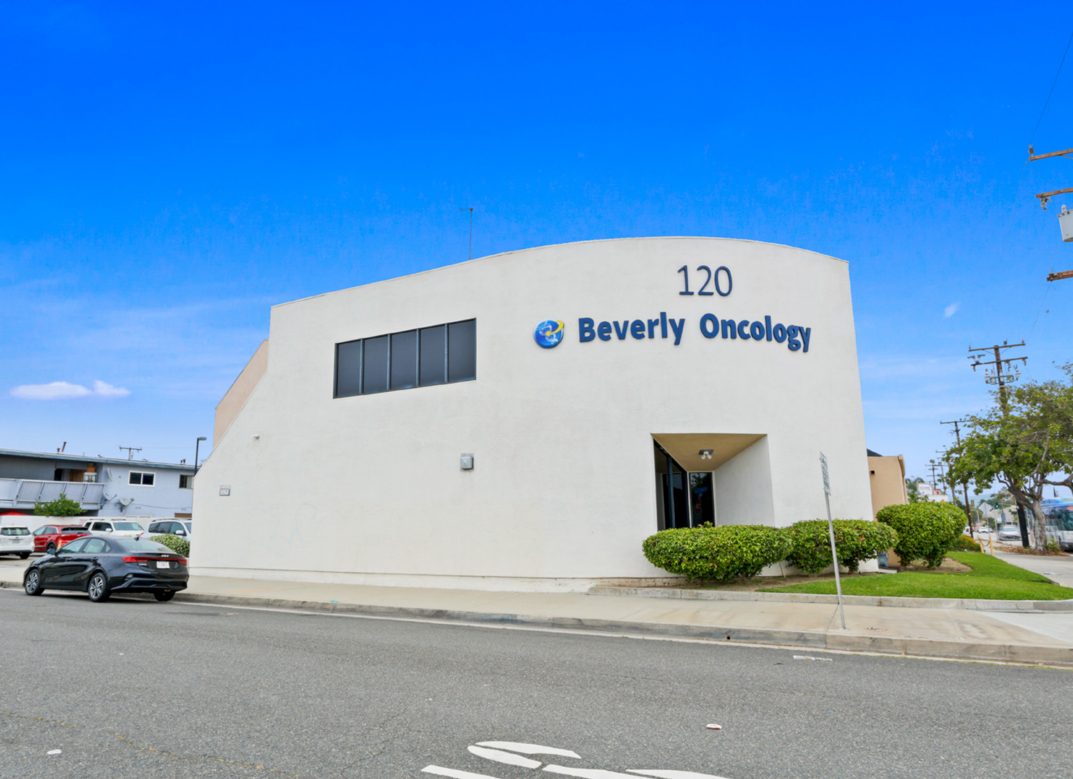
120 W BEVERLY BLVD, MONTEBELLO, CA