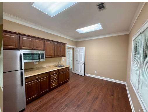
Office 4/Break Room