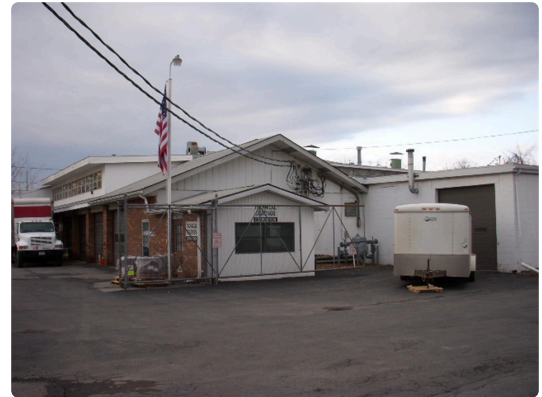
03/07/2016 - Photo

SWIS 510800 Status Active Roll Section Taxable Property Class 714 - Lite Ind Manftr Ownership Code In Ag District No Zoning SD - Special Distric Neighborhood 8005 Midtown School District KINGSTON CONSOLIDA Property Description 40-62 Total Acreage/Size 192 x 159 Deed Book 02855 Deed Page 00152 Grid East 628694 Grid North 1132660