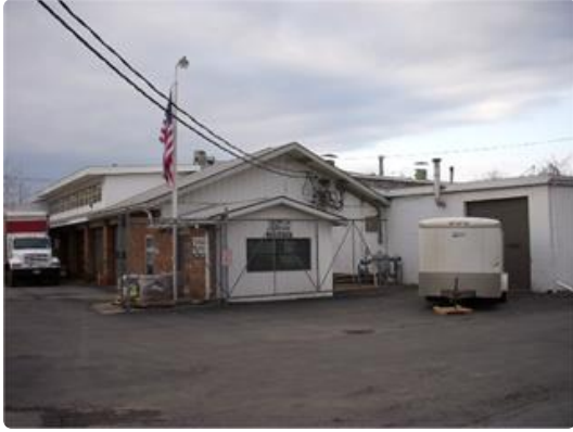
03/07/2016 - Photo