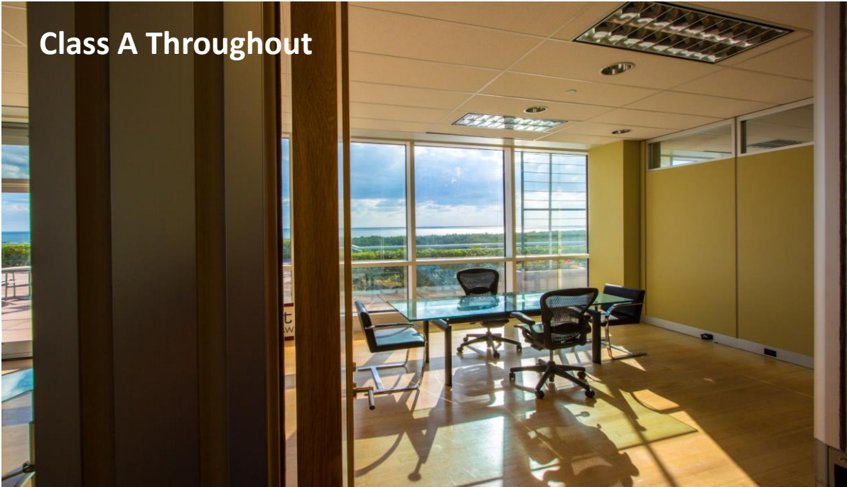
Class A Throughout