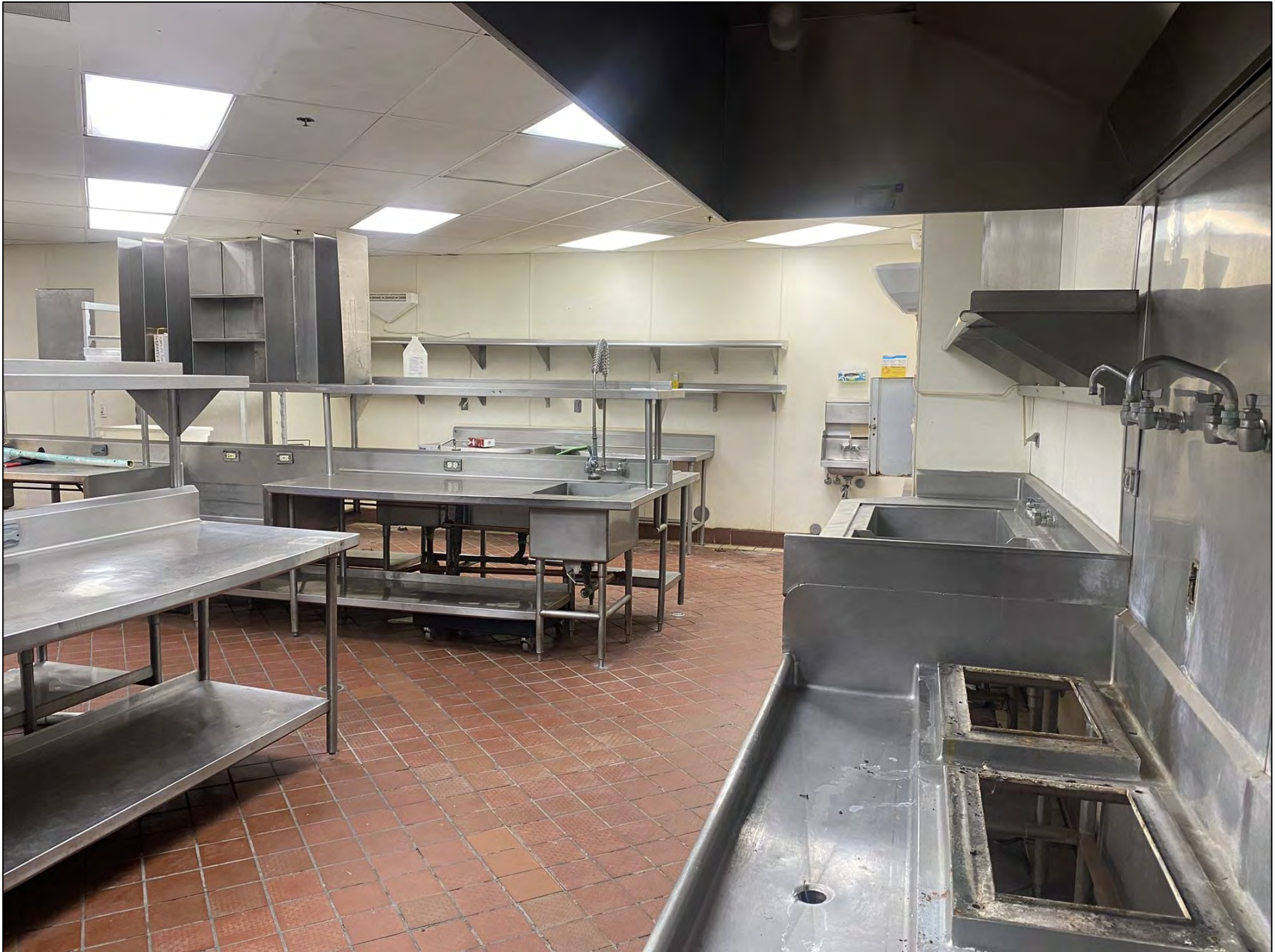
The information contained herein has been obtained from sources we deem reliable. We cannot, however, assume responsibility for its accuracy.