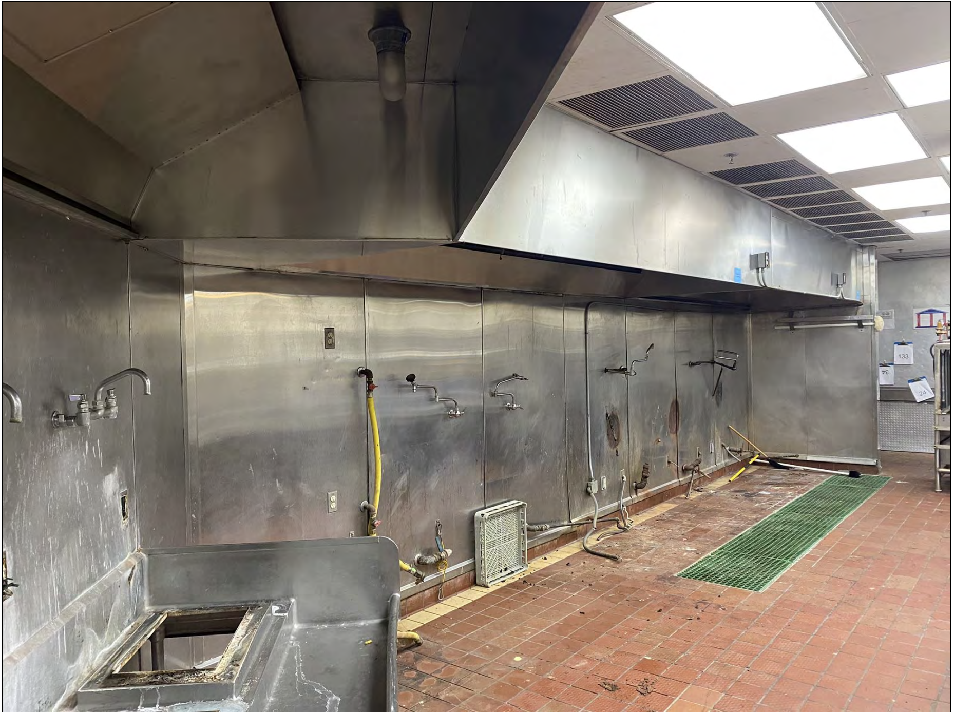
The information contained herein has been obtained from sources we deem reliable. We cannot, however, assume responsibility for its accuracy.