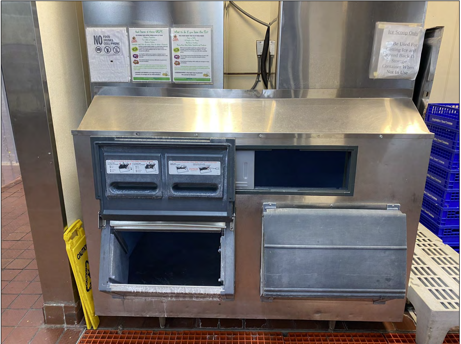
The information contained herein has been obtained from sources we deem reliable. We cannot, however, assume responsibility for its accuracy.