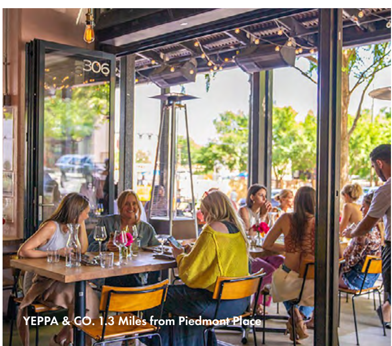
YEPPA & CO. 1.3 Miles from Piedmont Place