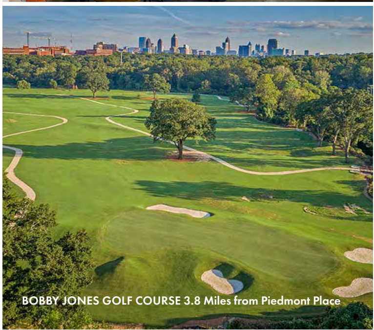
BOBBY JONES GOLF COURSE 3.8 Miles from Piedmont Place