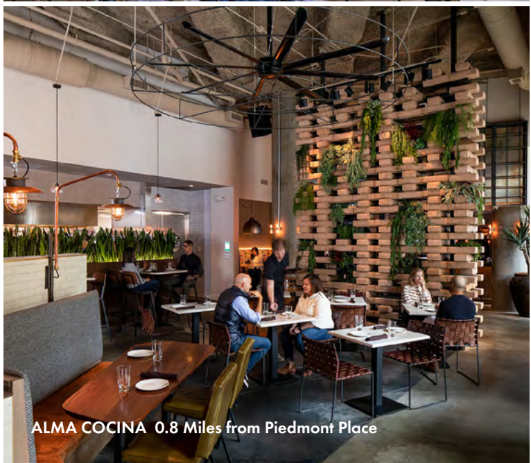
ALMA COCINA 0.8 Miles from Piedmont Place