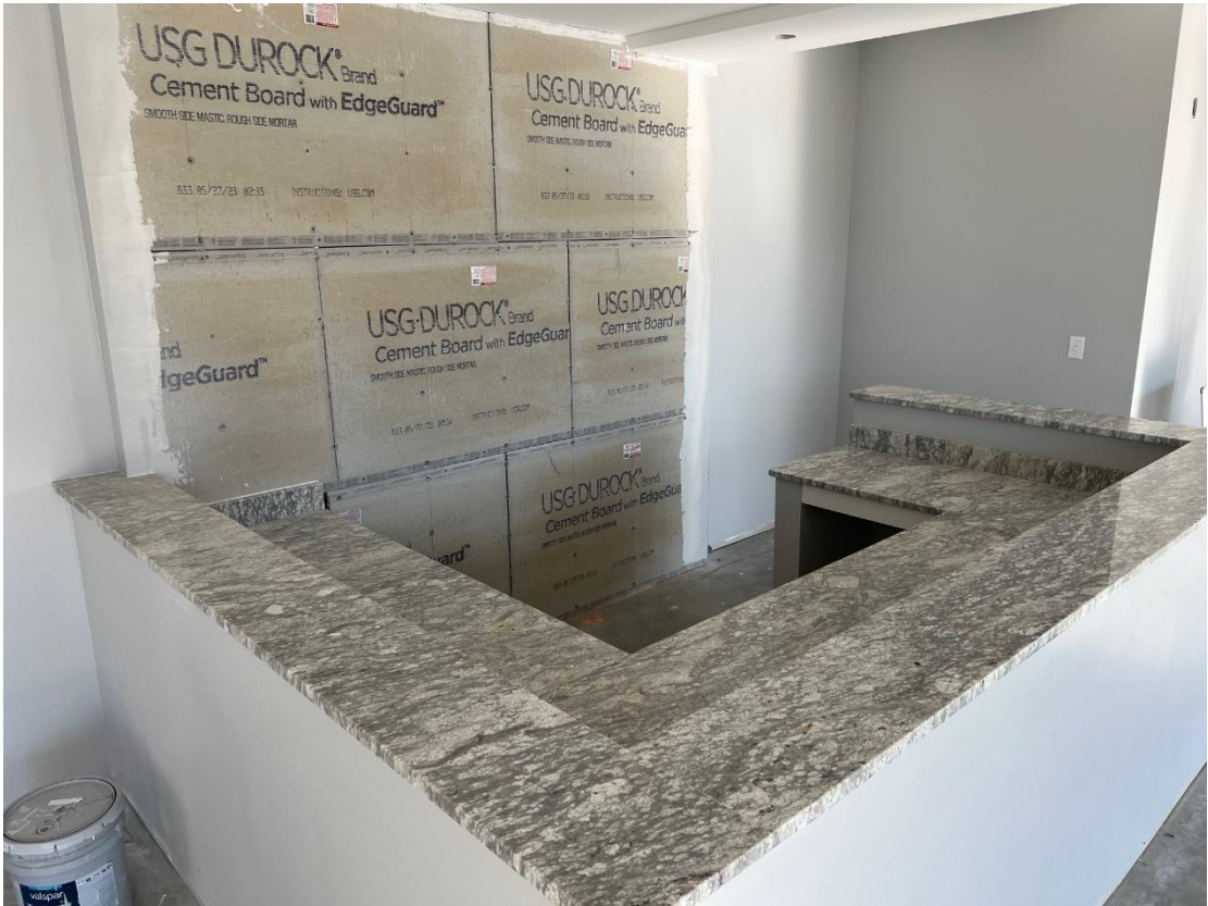
880 Broadway – Reception Desk