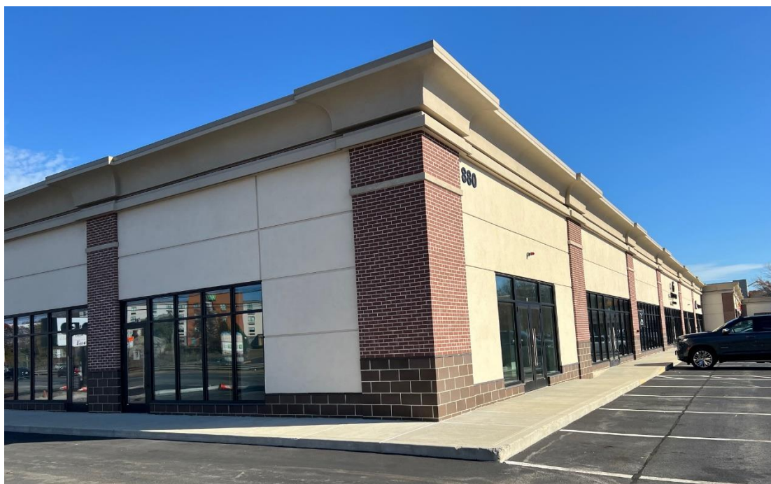
880 Broadway – End Cap Location