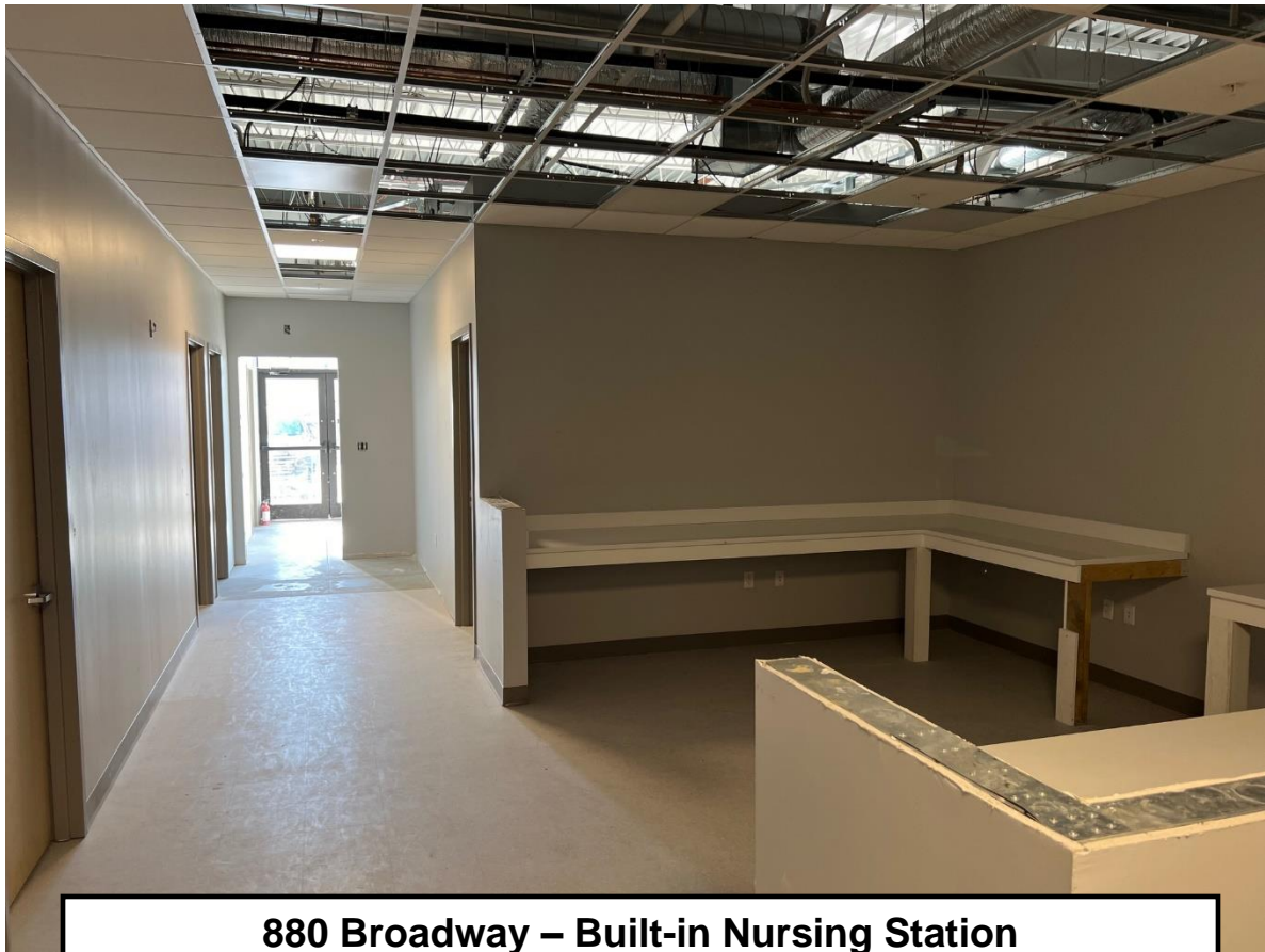
880 Broadway – Built-in Nursing Station

Leasing Information: tsnell@concordpropertymanagement.com Concord Property Management 978-369-6600