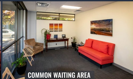
COMMON WAITING AREA