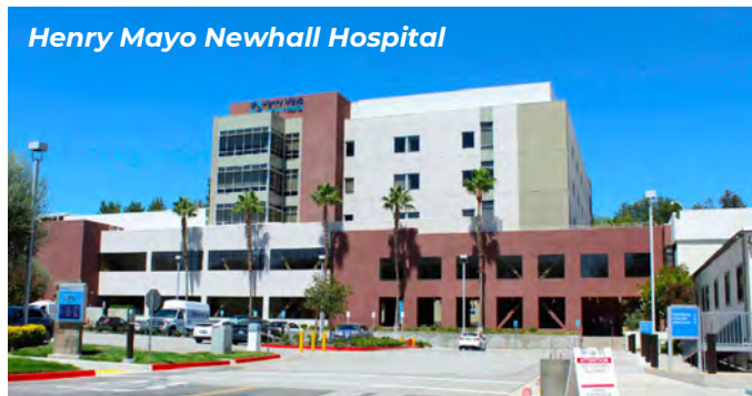
Henry Mayo Newhall Hospital