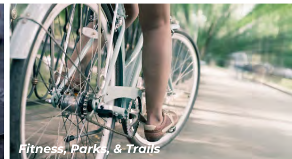
Fitness, Parks, & Trails