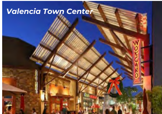
Valencia Town Center