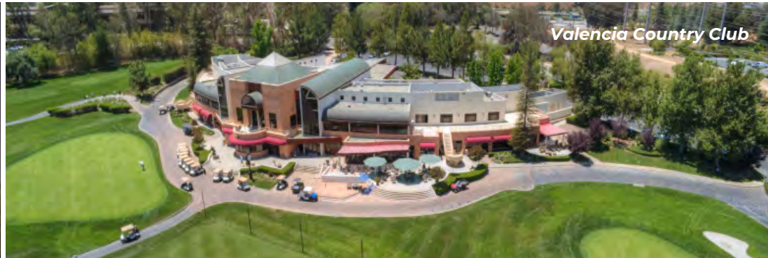
Valencia Country Club