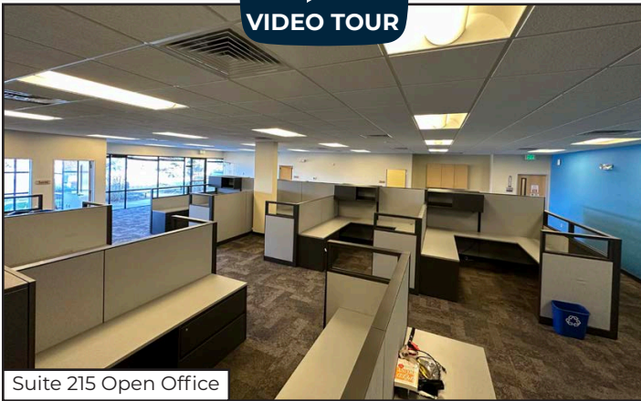
Suite 215 Open Office