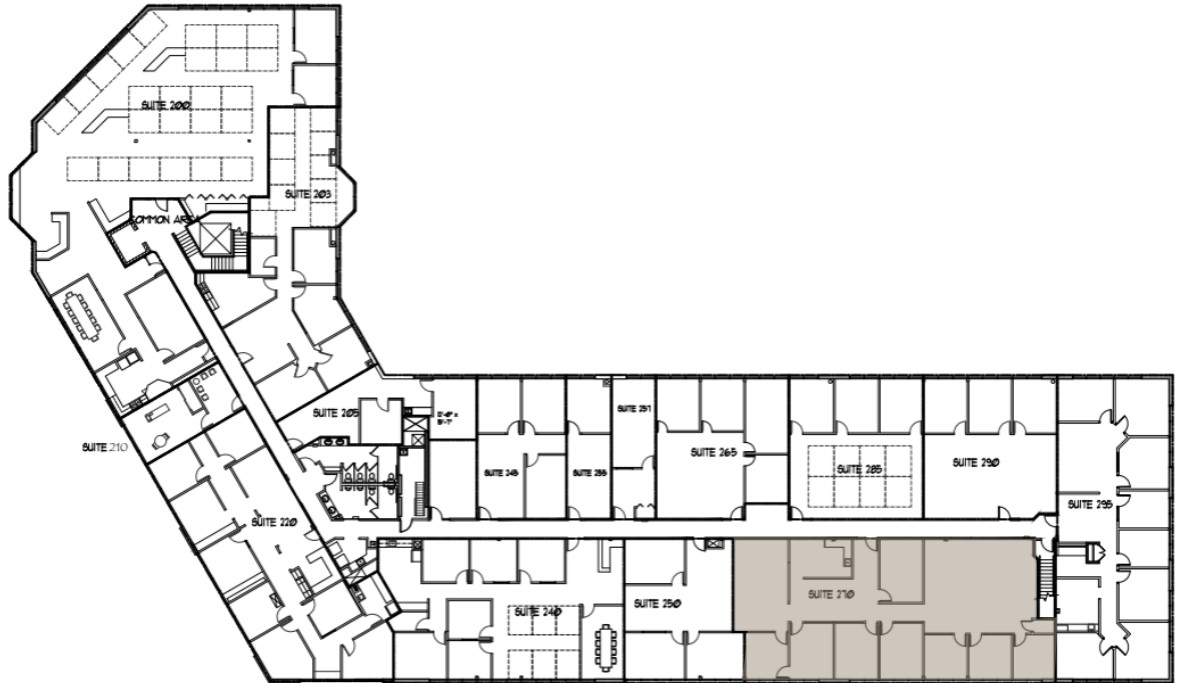
CROSSROADS 1300 BUILDING SECOND FLOOR