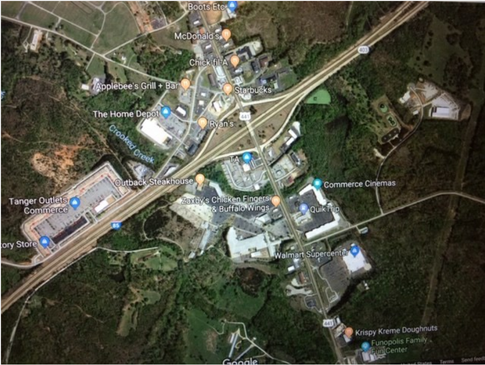
Busiest Retail Corridor