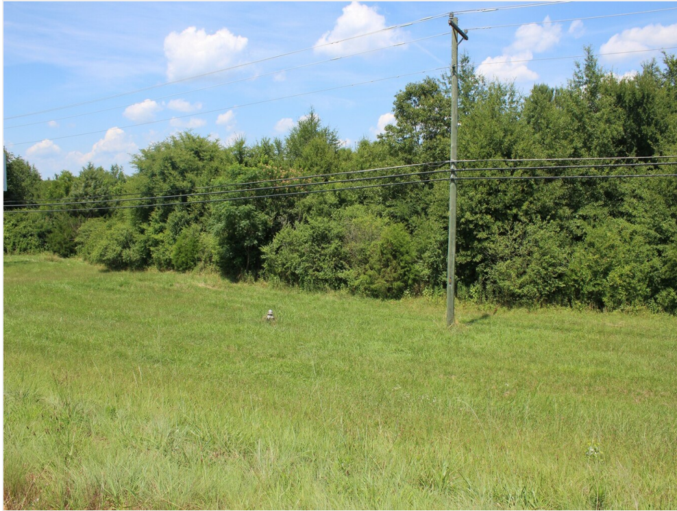
Land Close-up View