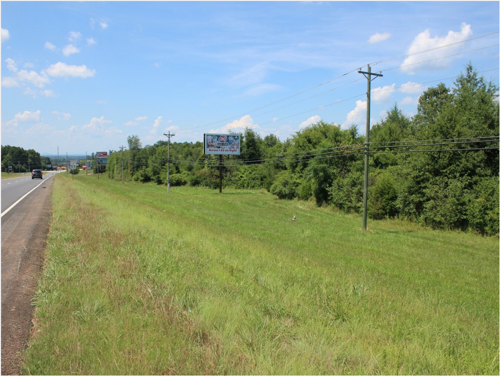
View From US Hwy-441 S