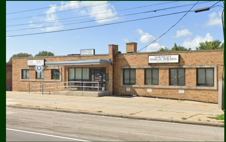
26151 Euclid Ave., Euclid, OH 44132

No warranty or representation, express or implied, is made as to the accuracy of the information contained herein. It is submitted subject to errors, omissions, price changes, rental or other conditions, withdrawal without notice, and to any special listing conditions imposed by our client.