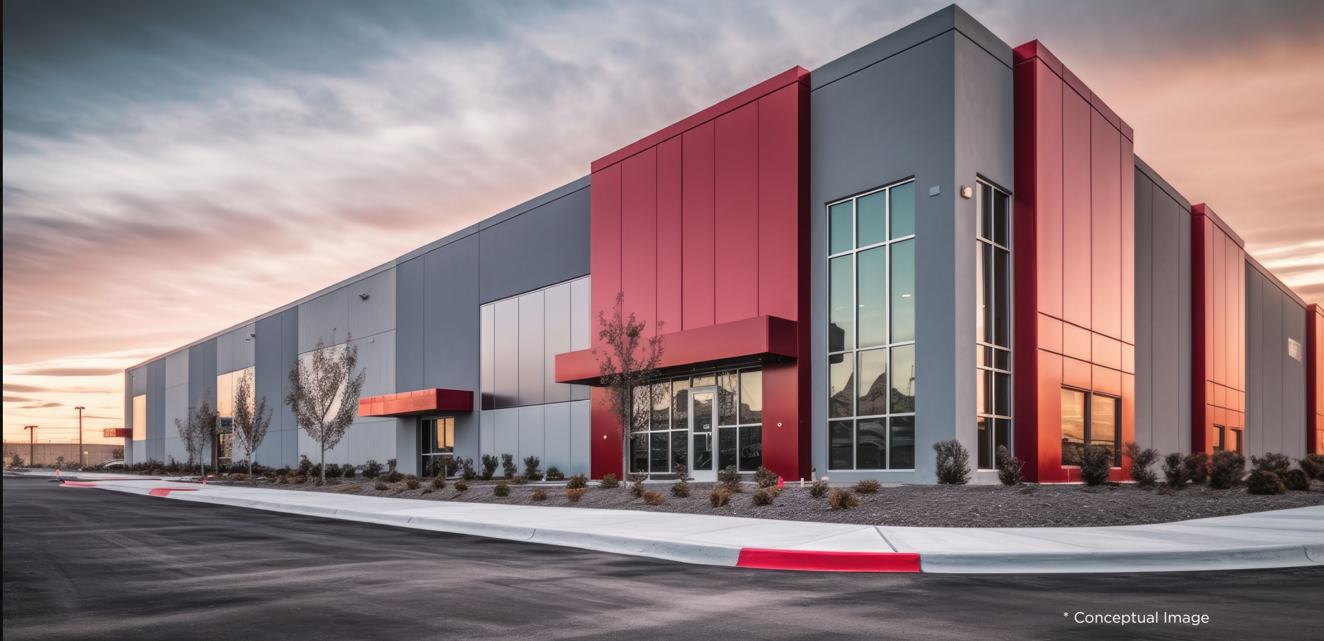
* Conceptual Image