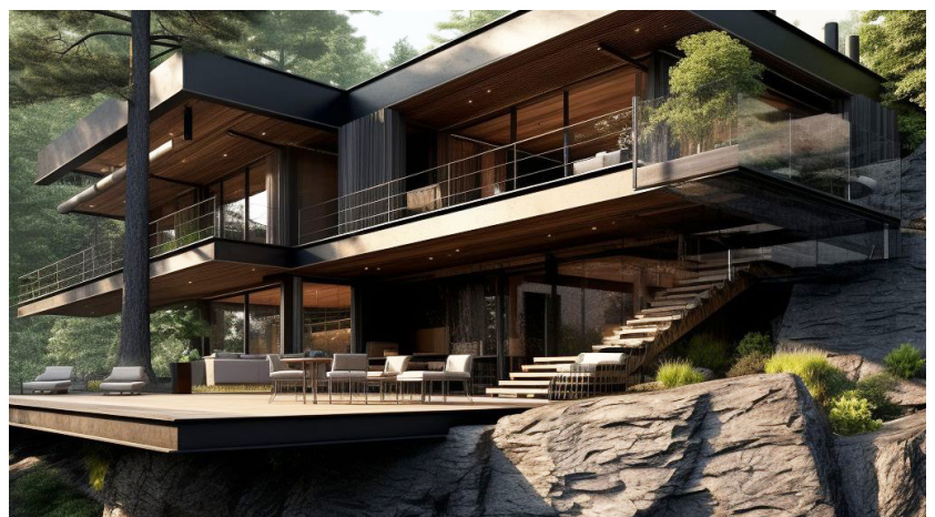
Architectural rendering of possible home in Granite Dells