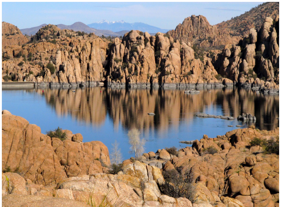
View of Watson Lake located adjacent to Granite Dells

This 24.31-acre parcel is located on one of Prescott's primary corridors, positioned between State Route 89 and E. Granite Dells Rd. This location is renowned for the exposed bedrock and large granite boulders as well as the adjacent Watson and Willow Lakes. The parcels are zoned to allow for many potential residential as well as business uses. The 24.91 acre parcel had previous site designs for a 36 lot custom home subdivision (lot layout available on request). This lot stands as one of the few remaining opportunities in this highly sought after residential area. It features excellent visibility to State Route 89 and unbeatable geological features.