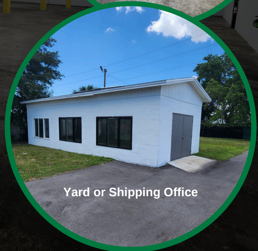
Yard or Shipping Office