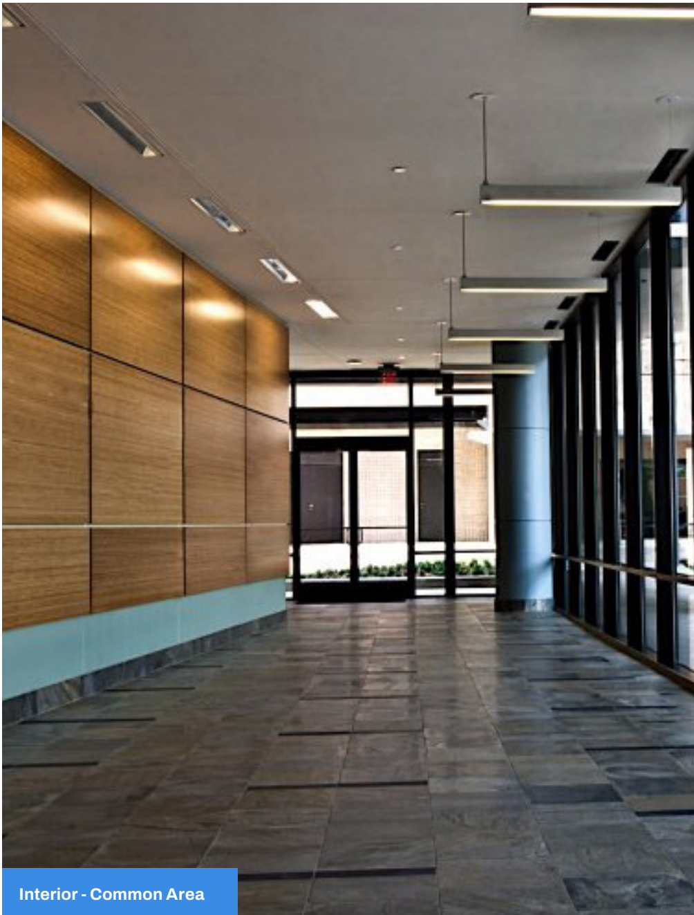
Interior - Common Area