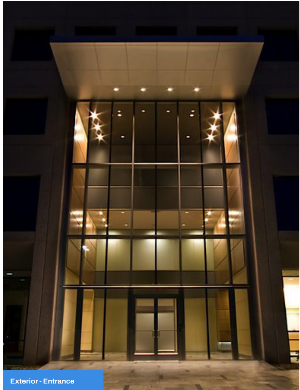
Exterior - Entrance