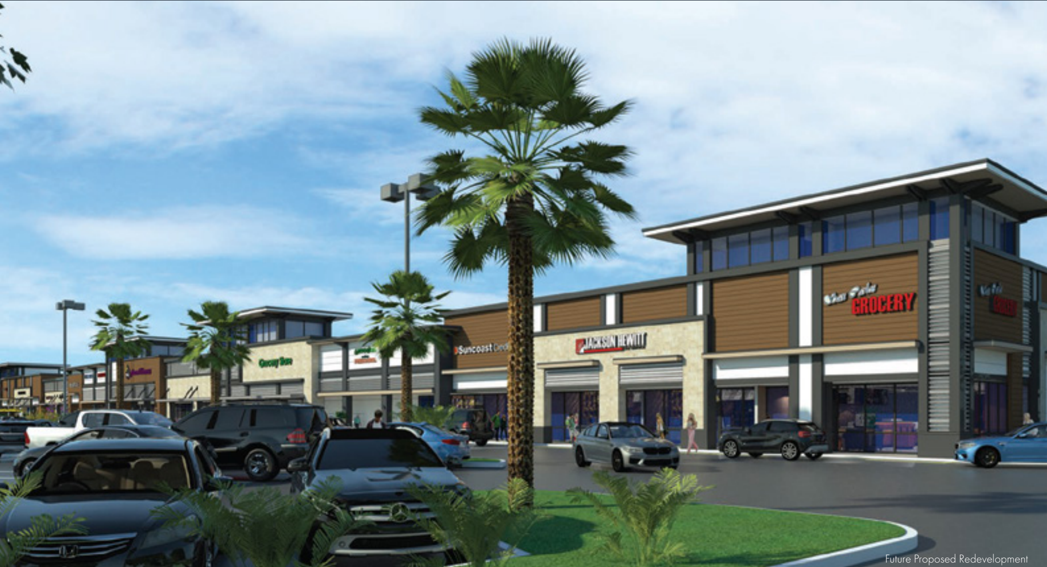
Future Proposed Redevelopment