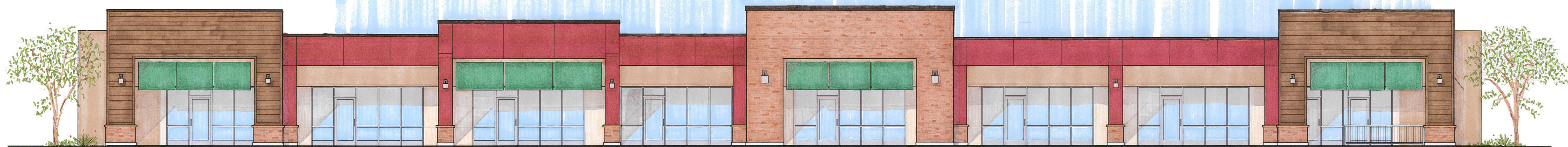
SCHEME 'B-R' - COLORED SOUTH ELEVATION