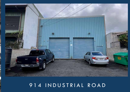
914 INDUSTRIAL ROAD