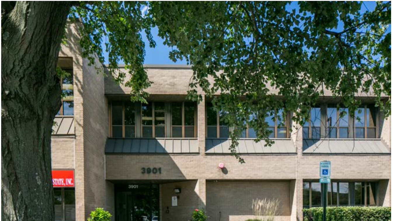
3901 NATIONAL DRIVE