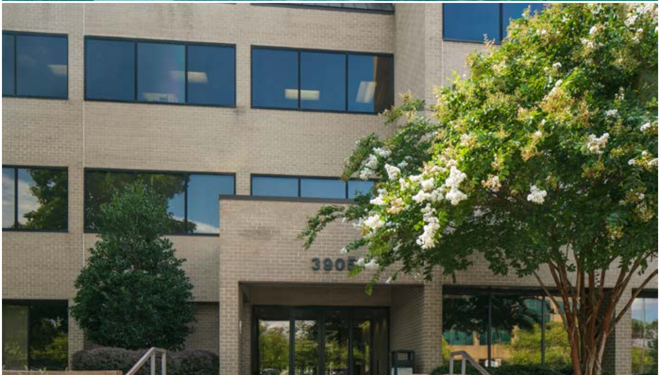
3905 NATIONAL DRIVE