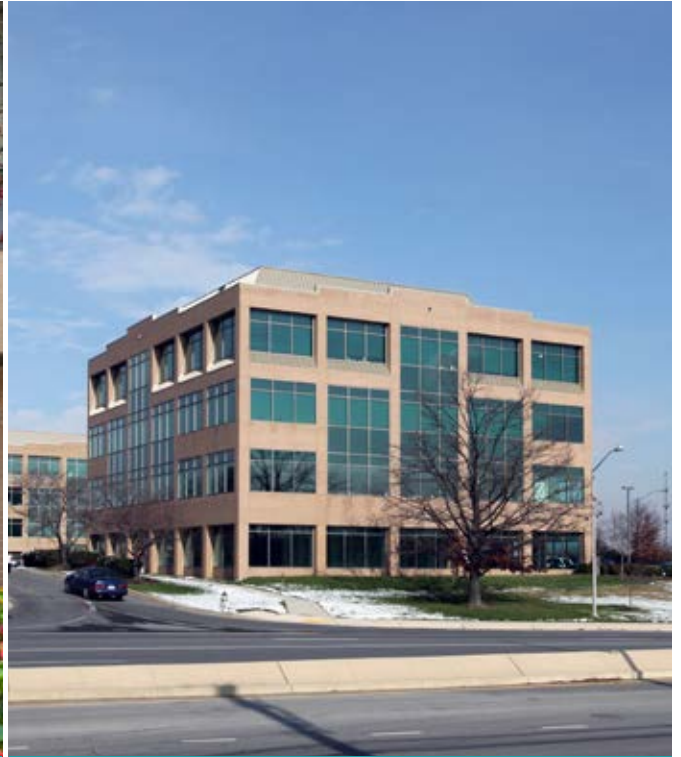
3915 NATIONAL DRIVE