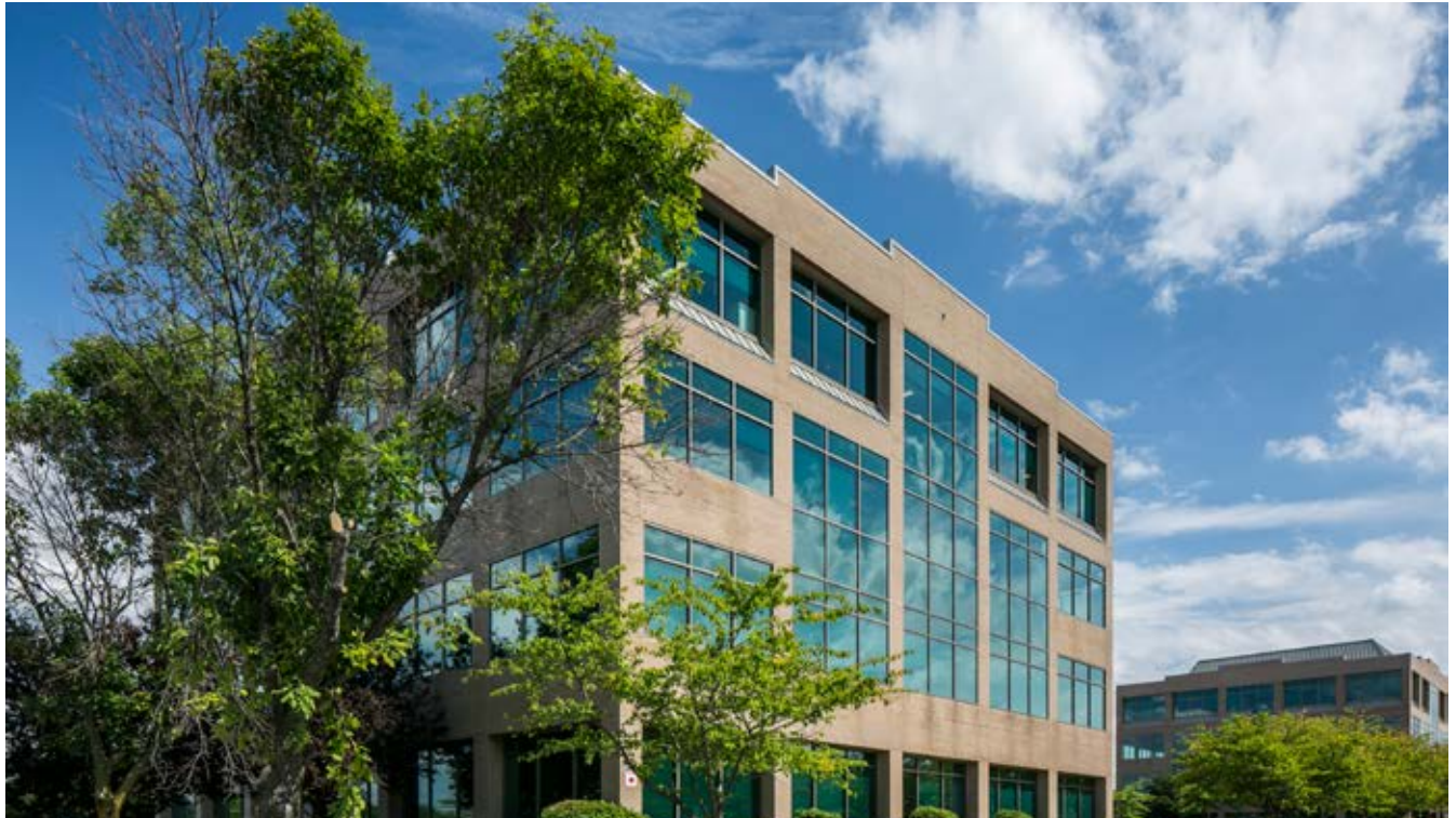
3919 NATIONAL DRIVE