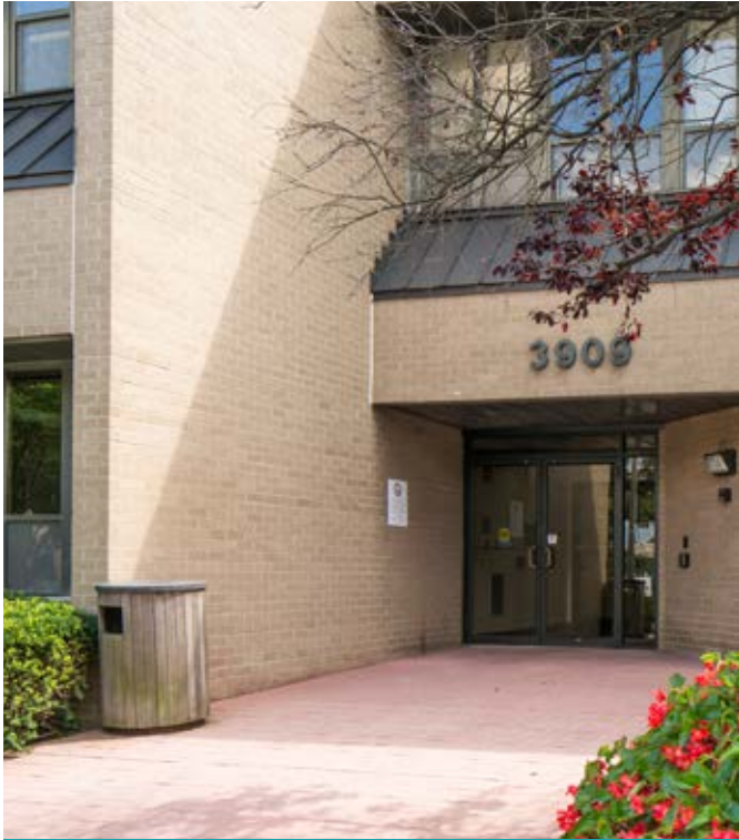
3909 NATIONAL DRIVE