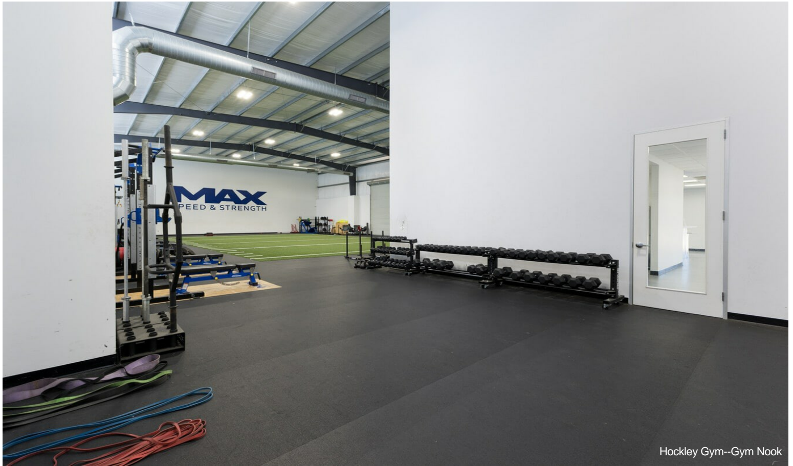
Hockley Gym--Gym Nook