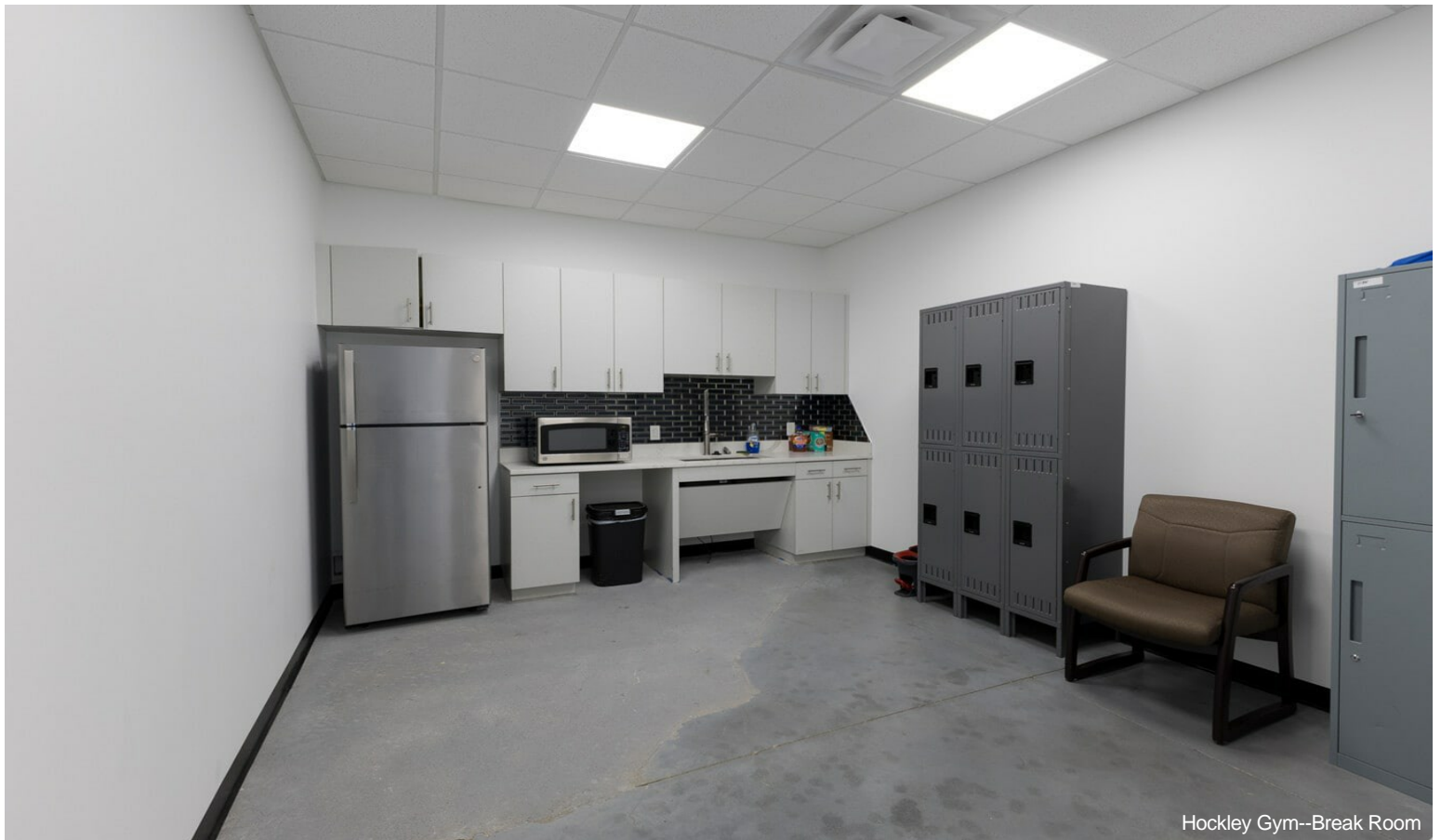
Hockley Gym--Break Room