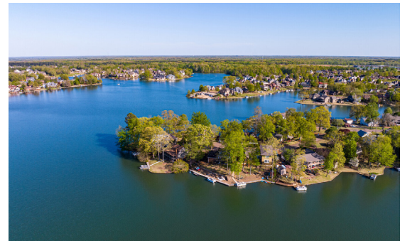
"The Lake District" Conceptual Rendering