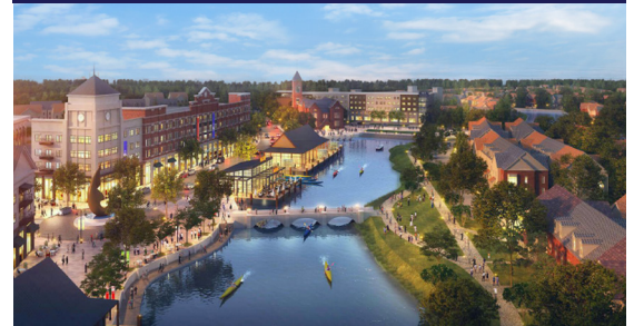
"The Lake District" Conceptual Rendering