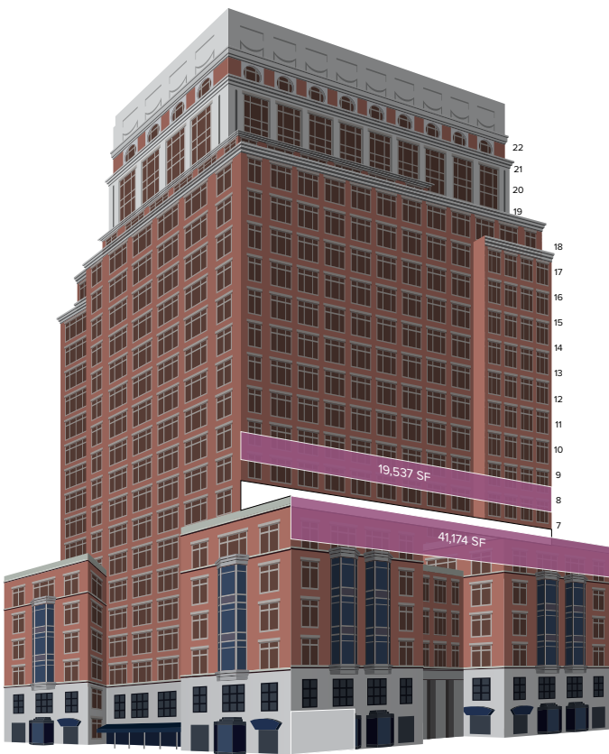
222 Berkeley Street