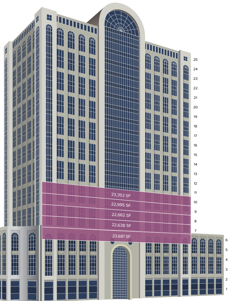
500 Boylston Street