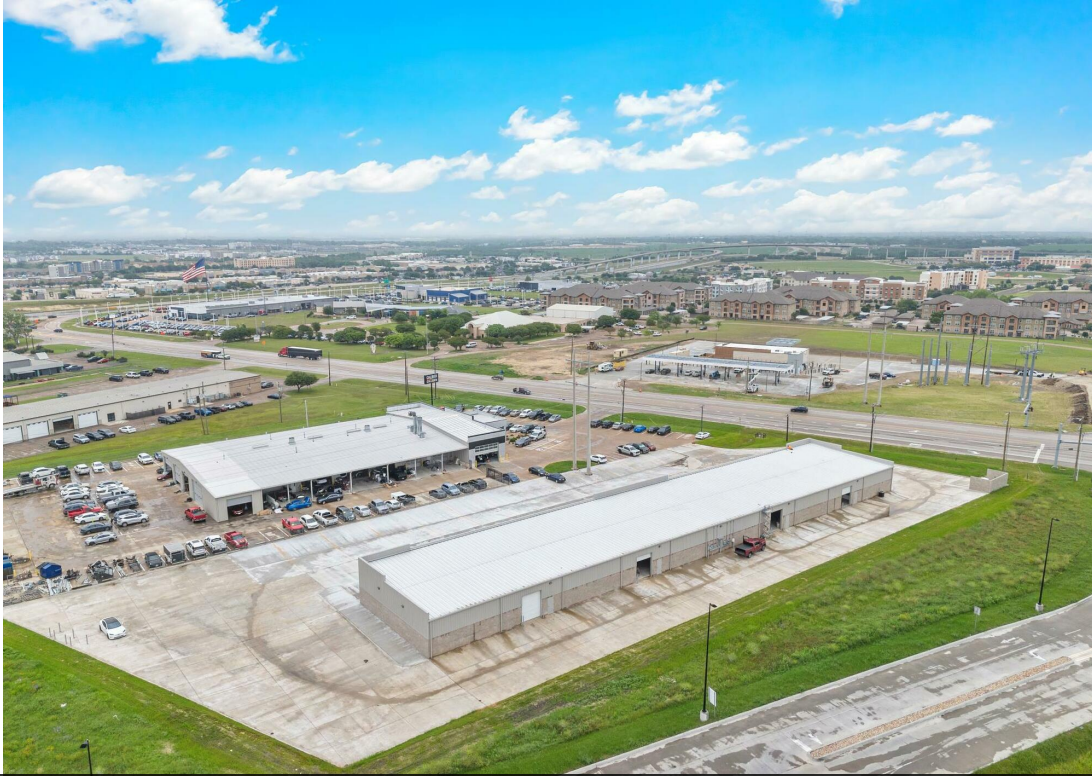
Facing Bagby Avenue

Bagby Avenue Office Warehouse | 5759 Bagby Avenue, Waco, TX 76712