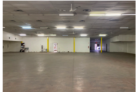
South Warehouse or Extended Sales Floor