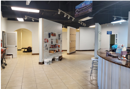
Office Showroom/Sales Counter