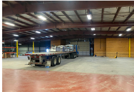
North Warehouse w/ 20'x14' Loading Door