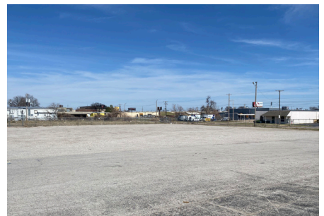
Gravel and Paved Yard Area