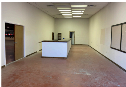
NE/c Will Call Sales Counter