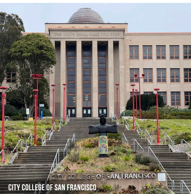
CITY COLLEGE OF SAN FRANCISCO