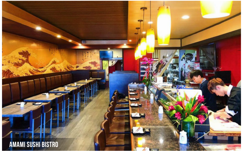
AMAMI SUSHI BISTRO