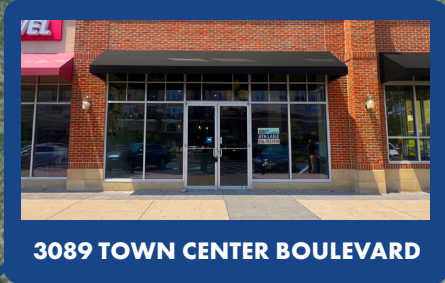
3089 TOWN CENTER BOULEVARD