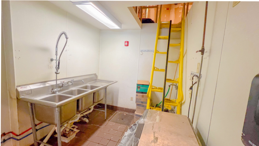
Loft Storage Space