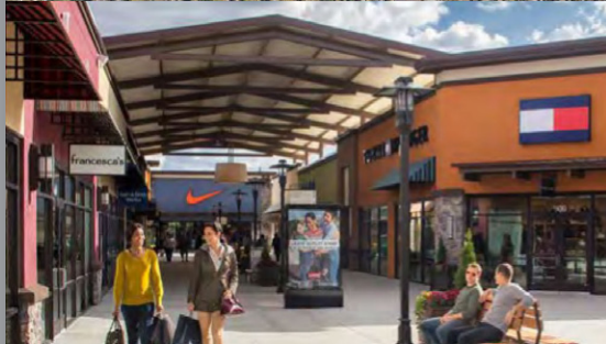
Outlets of Des Moines