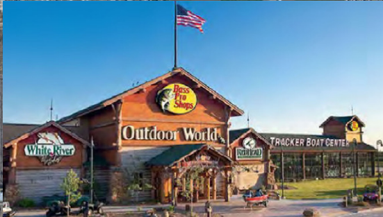
Bass Pro Shops