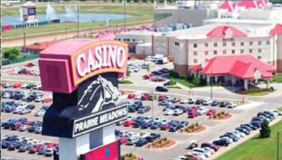
Prairie Meadows Casino