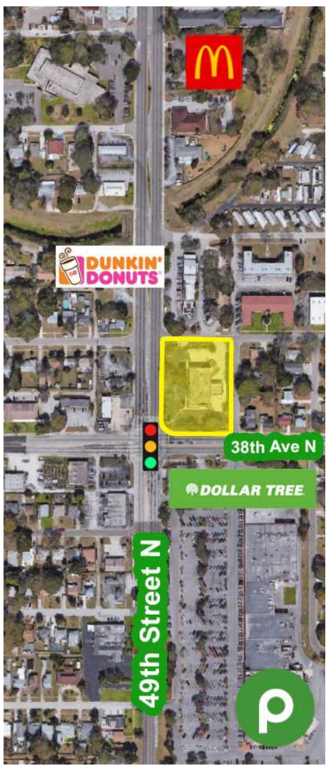
Zoned CCS-1, the property offers 272 feet of frontage on 49<sup>th</sup> St. at a lighted intersection with excellent ingress/egress. Average (AADT) daily traffic is approximately 27,500 on 49<sup>th</sup> St. N and 16,000 on 38<sup>th</sup> Ave. N. Disston Plaza rests directly across 38<sup>th</sup> Ave. N and is anchored by Publix and includes Dollar Tree and the long-time local favorite Toby's Original Little Italy Pizza. The site's central location is close to Interstate 275, U.S. Hwy. 19, and Downtown St. Petersburg.

PROPERTY DESCRIPTION: PNC Bank offers 3,014 square feet of office/retail space next to its branch location at 3801 49<sup>th</sup> Street N in St. Petersburg, Fla. The selected tenant can customize the space that currently sits in grey shell condition. Ideal users for the space include professional office workers, health professionals, personal service providers or specialty retailers. The building is not in a flood zone and offers ample parking and monument signage on the 1.31- acre parcel. PNC Bank is a Fortune 500 company with a presence in the country's 30 largest markets. Call listing agent for complete lease terms.