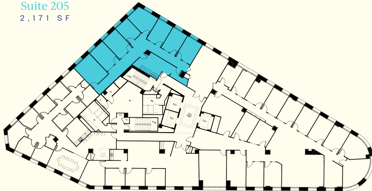
Suite 205 2,171 SF