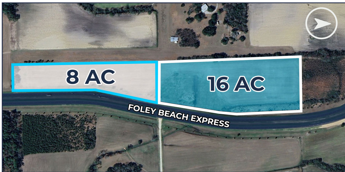
ADJACENT 8 AC PARCEL AVAILABLE

NO WARRANTY OR REPRESENTATION, EXPRESS OR IMPLIED, IS MADE AS TO THE ACCURACY OF THE INFORMATION CONTAINED HEREIN, AND THE SAME IS SUBMITTED SUBJECT TO ERRORS, OMISSIONS, CHANGE OF PRICE, RENTAL OR OTHER CONDITIONS, PRIOR SALE, LEASE OR FINANCING, OR WITHDRAWAL WITHOUT NOTICE, AND OF ANY SPECIAL LISTING CONDITIONS IMPOSED BY OUR PRINCIPALS. NO WARRANTIES OR REPRESENTATIONS ARE MADE AS TO THE CONDITION OF THE PROPERTY NOR ANY HAZARDS CONTAINED THEREIN ARE ANY TO BE IMPLIED.