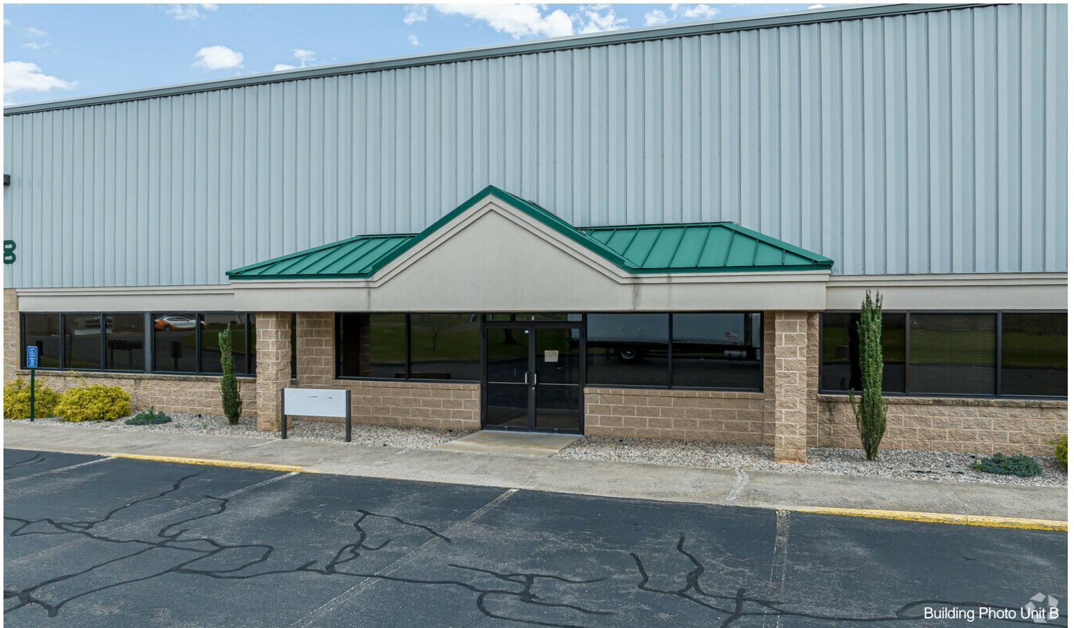
Building Photo Unit B