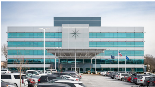
Kompass Kapital Plaza