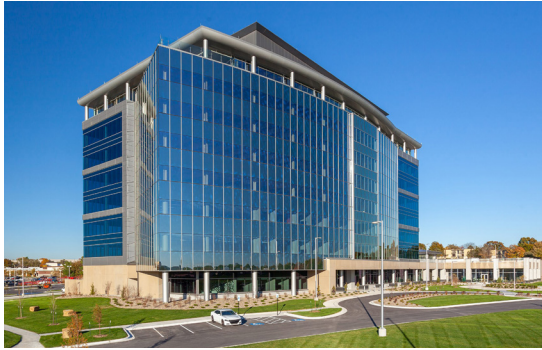
Shamrock Trading Campus