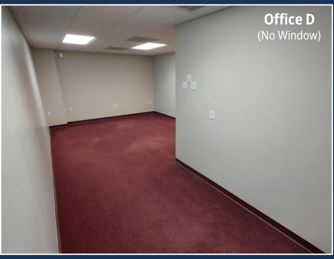
Office D (No Window)