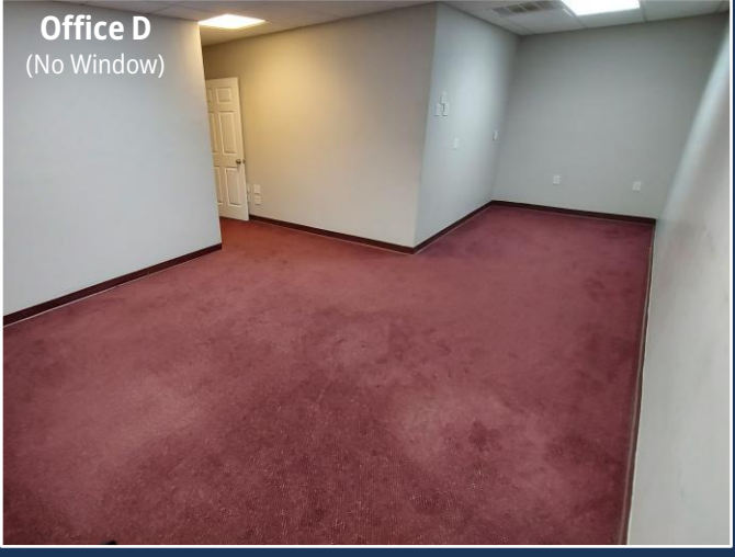
Office D (No Window)