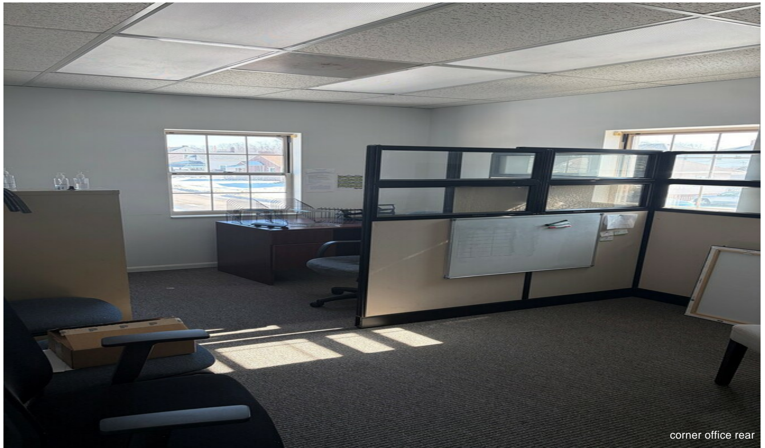
corner office rear