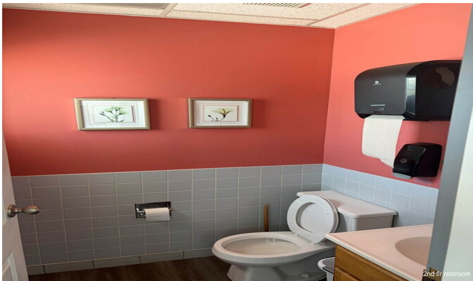
2nd flr restroom