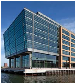
Thames Street Wharf Baltimore, Maryland