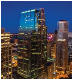
RBC Plaza Minneapolis, Minnesota