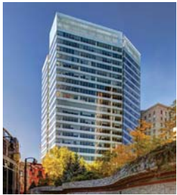
222 Main Salt Lake City, Utah

not only where you do business that matters, but how you do business. Our "hands-on" approach has led us to many successes, gaining us profound trust with our clients. At KBS, we believe our people are our greatest asset and our tireless efforts to conduct good business has not only earned us repeat investment opportunities, but also formed long lasting relationships.