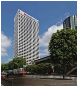
Union Bank Plaza Los Angeles, California