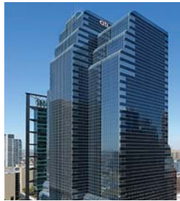
500 West Madison Chicago, Illinois