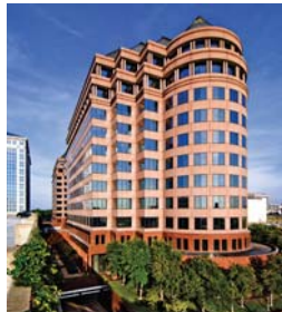
Providence Towers Dallas, Texas