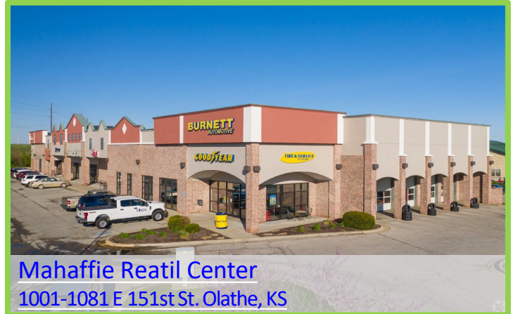
Mahaffie Reatil Center 1001-1081 E 151st St. Olathe, KS