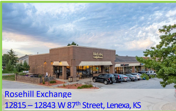
Rosehill Exchange 12815 - 12843 W 87 th Street, Lenexa, KS