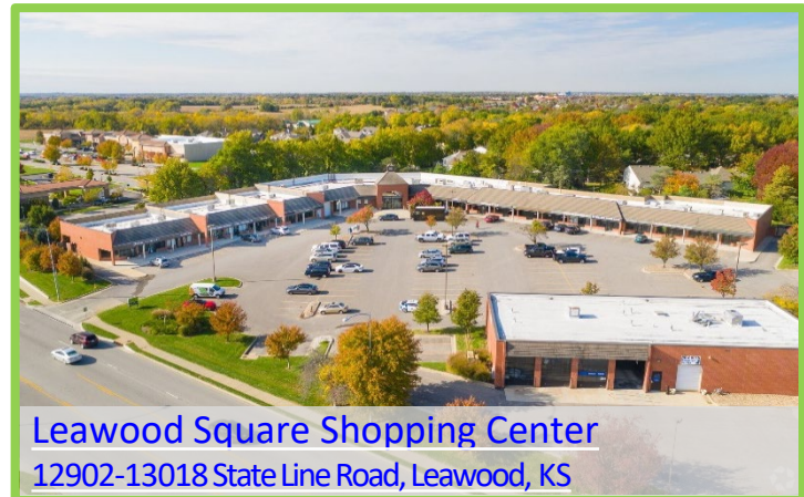
Leawood Square Shopping Center 12902-13018 State Line Road, Leawood, KS