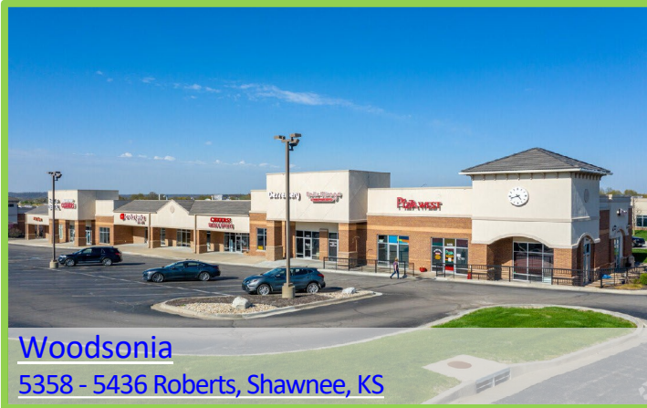
Woodsonia 5358 - 5436 Roberts, Shawnee, KS