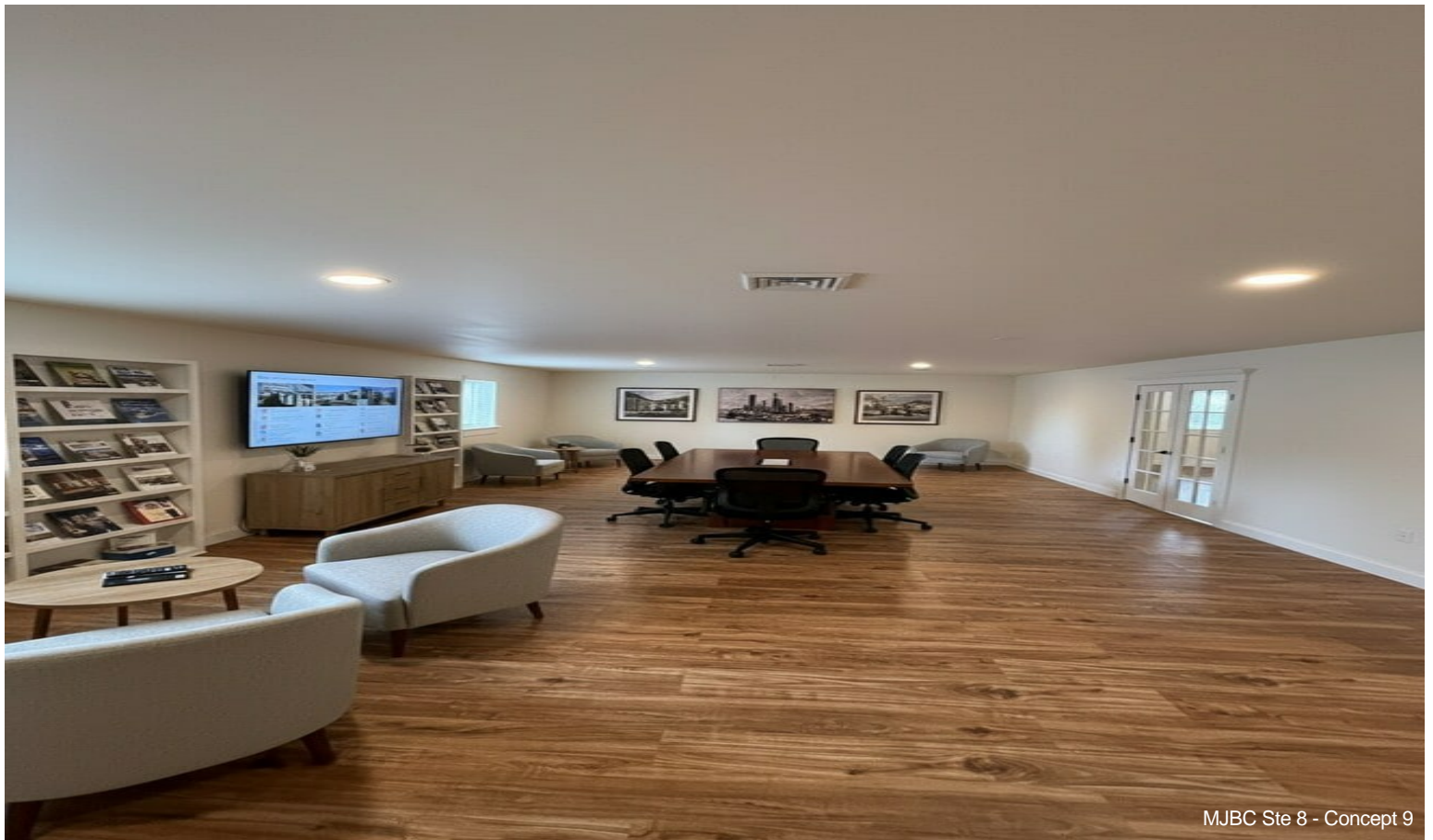
MJBC Ste 8 - Concept 9