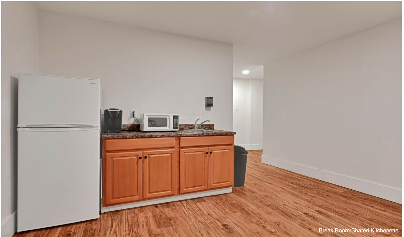
Break Room/Shared Kitchenette