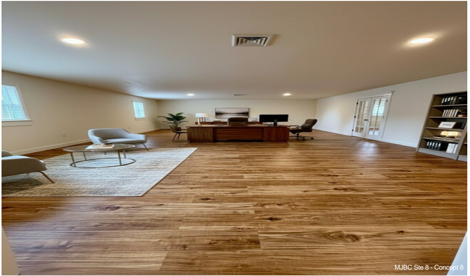
MJBC Ste 8 - Concept 8